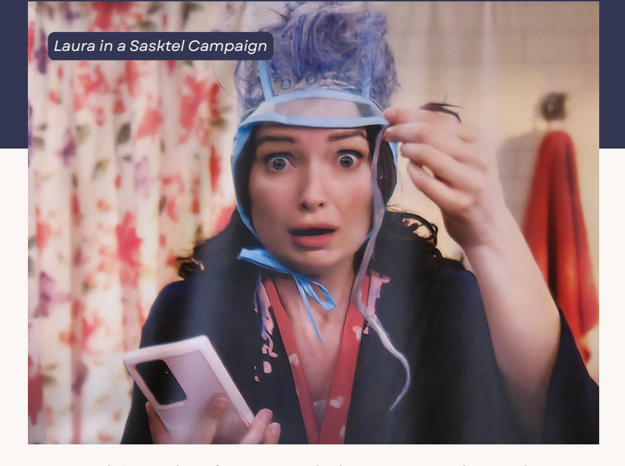
One thing that's stayed the same, though? My lucky orange highlighter.