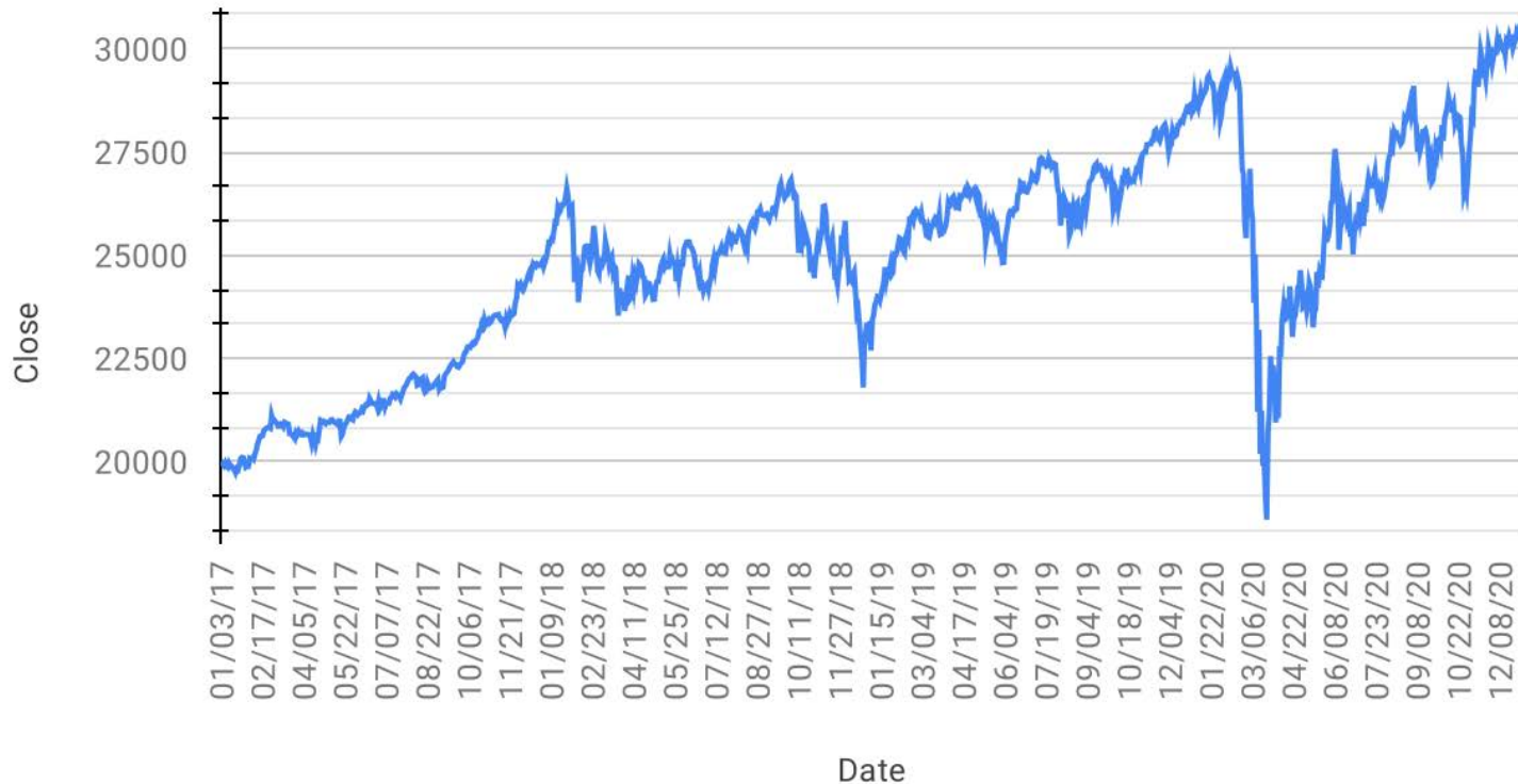
DJIA History 2017-2020