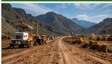
CONSTRUCTION ACCESS ROADS