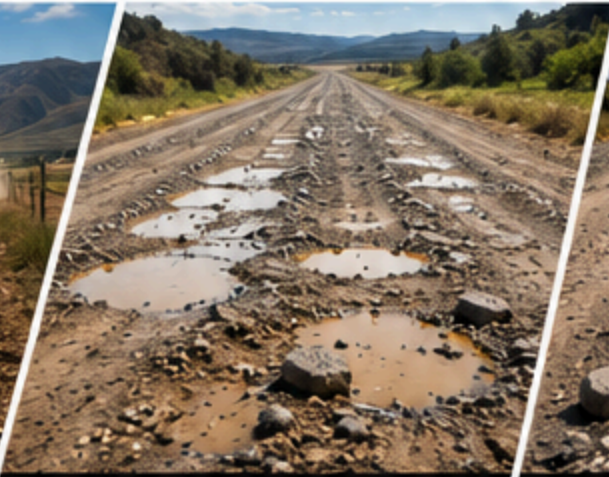
POTHoles & WASHBOARDING