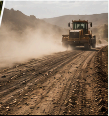
HIGH MAINTENANCE COSTS

Unstabilized roads lead to constant maintenance, high costs, dust, erosion and poor performance.