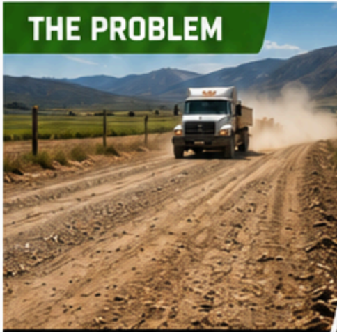
DUST & EROSION