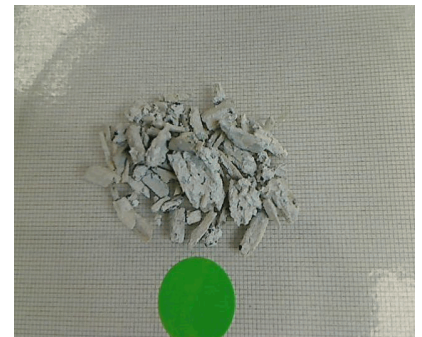
1323.3mg analyzed (1mm x 1mm scale)

Disclosures: All work was done at Beta Analytic in its own chemistry lab and AMSs. No subcontractors were used. Beta's chemistry laboratory and AMS do not react or measure artificial C 14 used in biomedical and environmental AMS studies. Beta is a C14 tracer-free facility. Validating quality assurance is verified with a Quality Assurance report posted separately to the web library containing the PDF downloadable copy of this report.