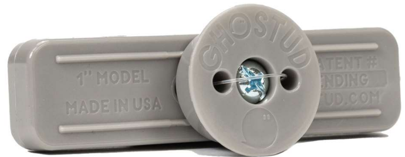
Ghostud® 1" Model