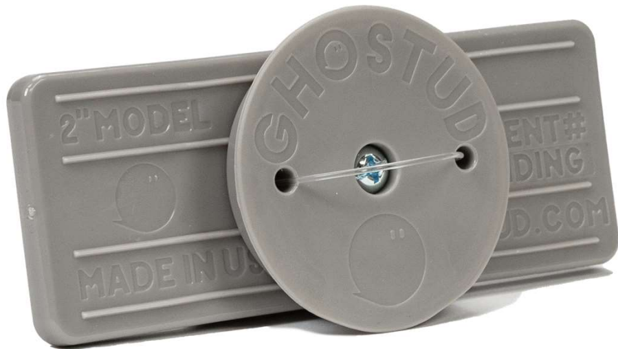
Ghostud® 2" Model