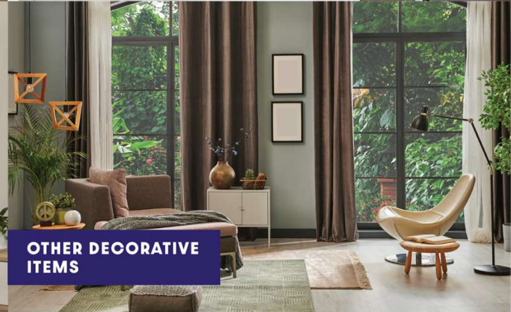
OTHER DECORATIVE ITEMS