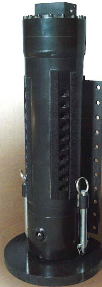
6" Bore, 70,000# capacity leg