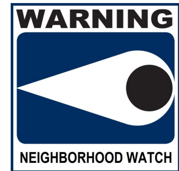
Official Neighborhood Watch Logo

This is a Crime Prevention program that involves citizens working with each other and with law enforcement agencies to reduce crime and victimization in their communities.