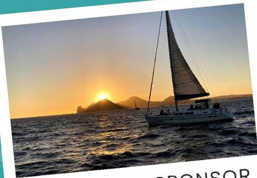
COMMUNITY SPONSOR $2500