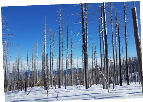
LIFESAVER SPONSOR $15,000