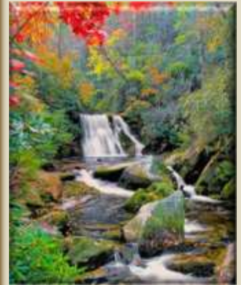
Yellow Creek Falls