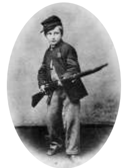
John Clem, 12 yrs old, Battle of Shiloh and Chickamauga