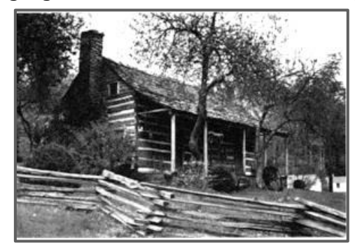
Gunter home built by early settlers

"To connect the two floors, a magnificently simple staircase was fabricated. Massive stringers were hewn from green timber and mortises or slots were cut into them to accept the tenons, or projections on the ends of the step treads that had been crafted from well-cured timber. The staircase was assembled using no nails, pegs, or glue – and as the green stringers dried, they shrunk around the tenons, creating joints that are still sound 120 years later. Roof boards or wooden shingles were rived or split from log sections of straight grain white oak to cover the building."