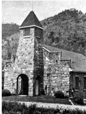
Stecoah Baptist Church

Because settlements were sparsely populated and transportation difficult, church services were held only once or twice a month. Worshipers often walked eight to ten miles to attend church. Many pastors served two or more churches. It was not until 1949 that the First Baptist of Robbinsville had a full time pastor.