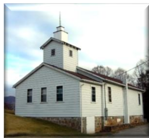
Old Mother Church today

Graham County from early on has been a deeply religious section. In pioneer days the meeting house and schoolhouse was a combination building of logs. Though in time many small meeting houses have scattered themselves over Cheoah Valley at each of the settlements. In great part, the religious history of the county centers around what is still known as "The Old Mother Church". As a child, the writer recalls the feeling of spiritual blessing on entering the building. It is unique in that it seems to have no creed. Methodist and Baptist alike have worshiped within the portals. It has served as a temple of justice. It has served as a temple of knowledge; and it has served as a temple of worship. Lastly it keeps silent watch over the departed. The Old Mother Church has sheltered and shared