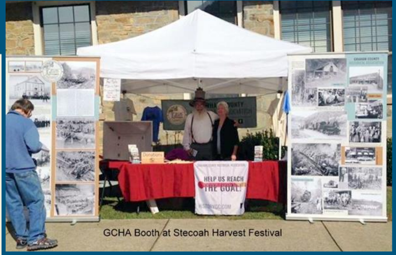
GCHA Booth at Stecoah Harvest Festival

October 20th & 21st Friday, 6 to 8pm Saturday, 10am to 6pm