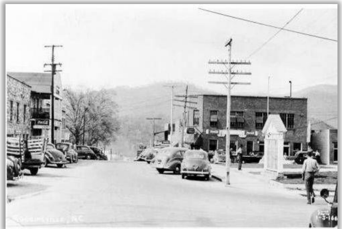
Above Courthouse Square looking down N. Main Street, Robbinsville, NC