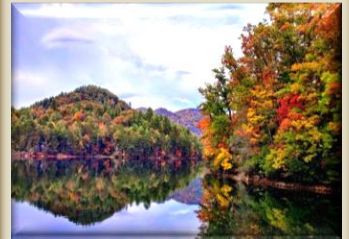
Autumn at Lake Santeetlah