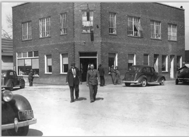
Ingram Drugstore Building - 1940