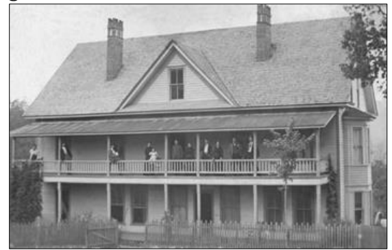
Slaughter Hotel - 1897

"Just before the turn of the century, the Slaughter Hotel was constructed."