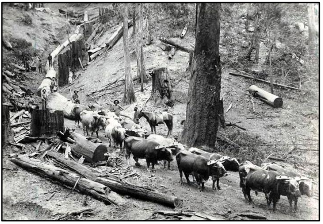
Ox team pulling logs down a steep slope