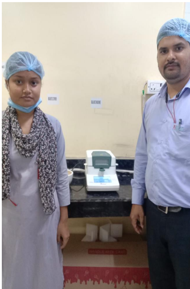
Topnotch Cones Pvt. Ltd., Nadia, WEST BENGAL Supply of Moisture Analyser