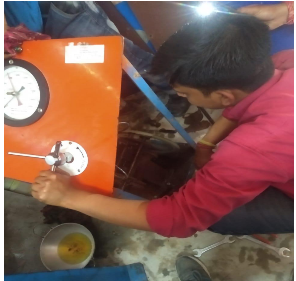
SHAW BROTHERS, KALNA, WEST BENGAL We Provide Repairing Services