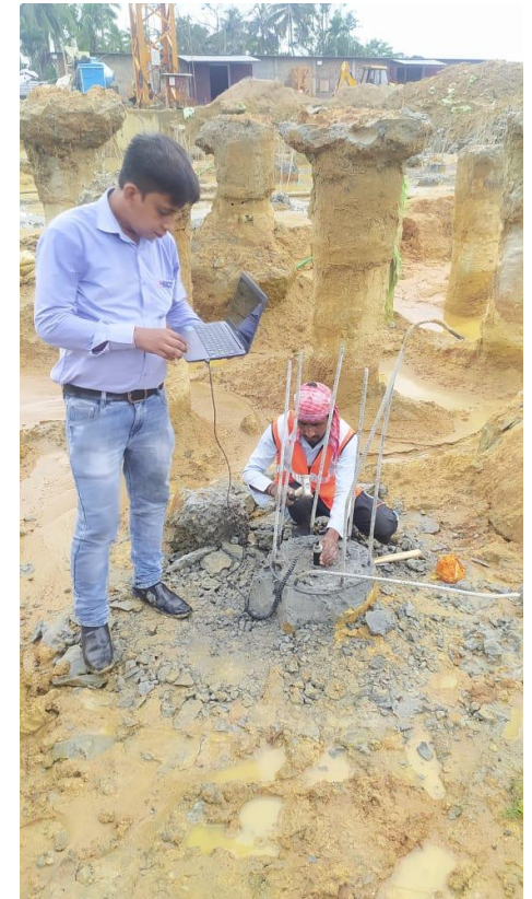
TRIPURESSARI DEVELOPERS, AGARTALA, TRIPURA