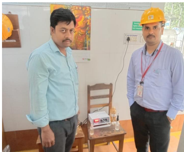
CSIR, DURGAPUR, WEST BENGAL Supply of Digital DO Meter