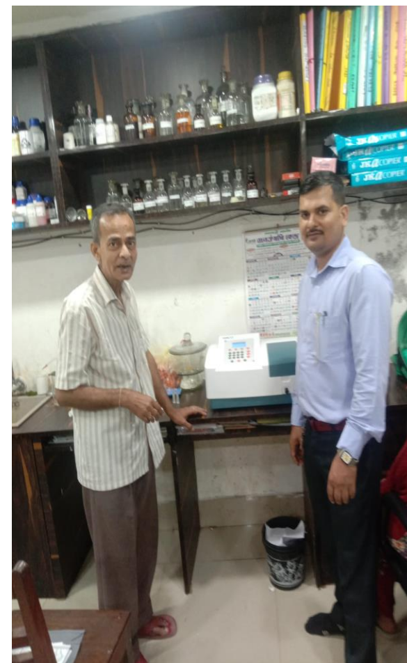
Alpana Industries, KOLKATA, WEST BENGAL Supply of Spectrophotometer