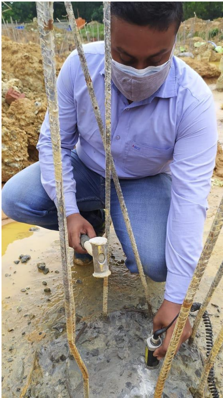
SUBHAM GROUP, AGARTALA, TRIPURA