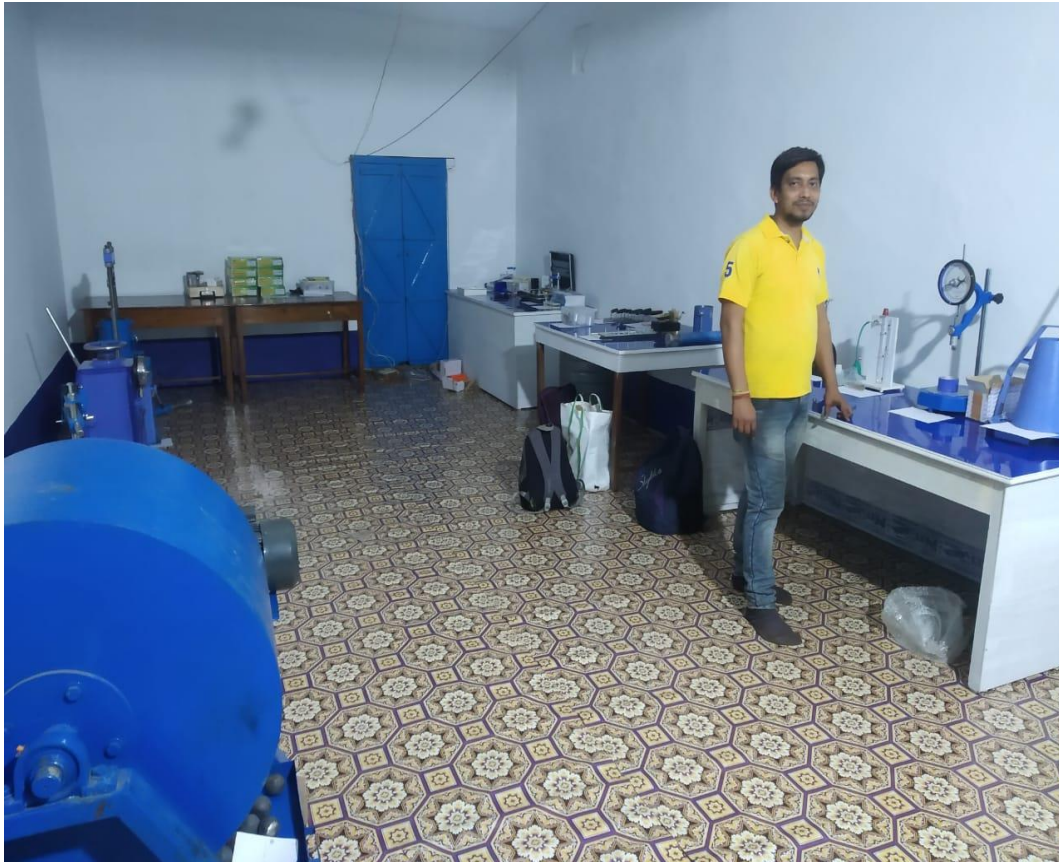
SAMUDRAGARH BLOCK, WEST BENGAL GOVERNMENT

We Provide Installation Services & Laboratory Setup.