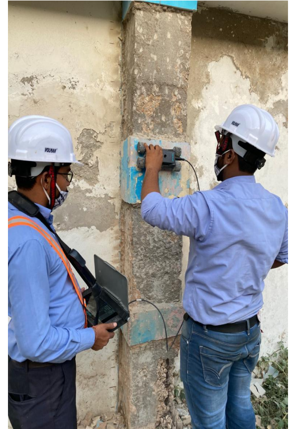
NDT AT DELHI EEPWD PROJECT

Please contact to +91 9163733432 asicoinstruments@gmail.com