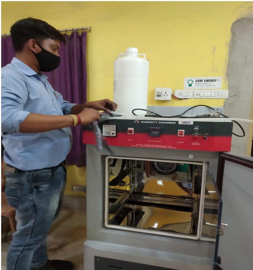
UAL KON-CRETE, BAGNAN, WEST BENGAL We Provide Installation Services