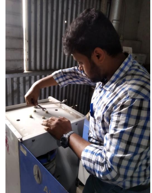
BCPL, DURGAPUR, WEST BENGAL