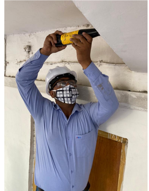
NDT AT DELHI MOULANA AZAD NEW DOCTOR'S HOSTEL PROJECT