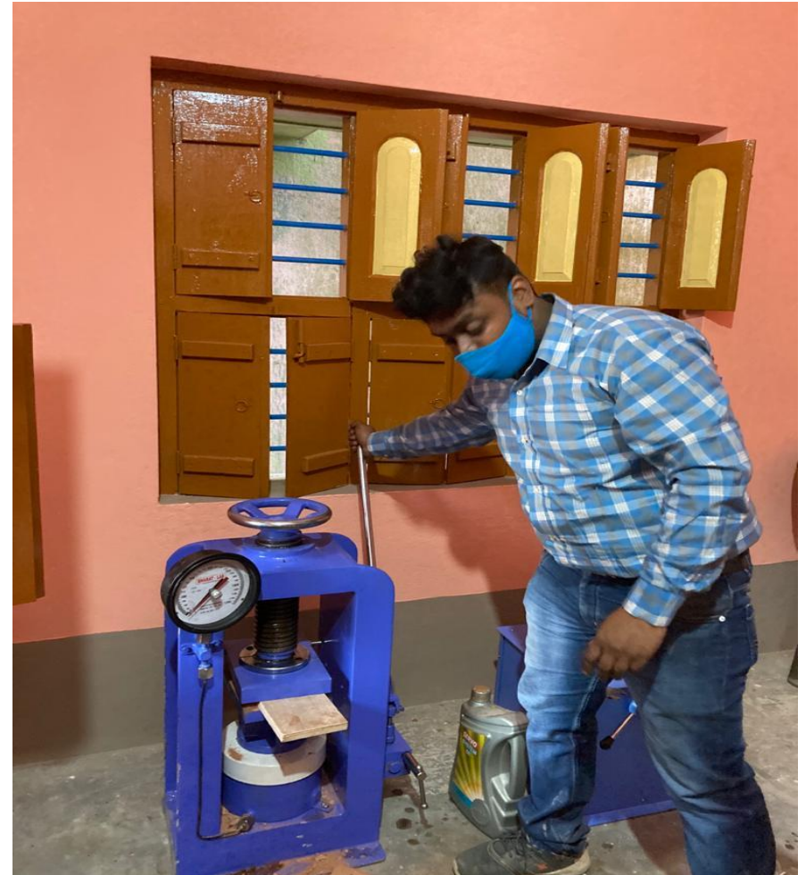
PANCHAYAT, BARDHAMAN, WEST BENGAL GOVERNMENT

We Provide Installation Services & Laboratory Setup.