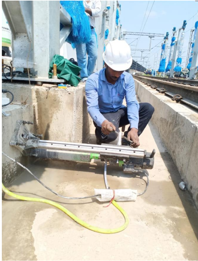
CORE CUTTING AT SCC INFRASTRUCTURE RANAGHAT, WEST BENGAL RAILWAY PROJECT

We provided Sales, Repairing Services, Calibrations, AMC of Civil Quality Control Instruments, Surveying Instruments, NDT Instruments and Consultancy Jobs like NDT of all kind of structures, Pile Integrity Testing etc. Also we provide Core Cutting Services. Online Consultancy services also provided.