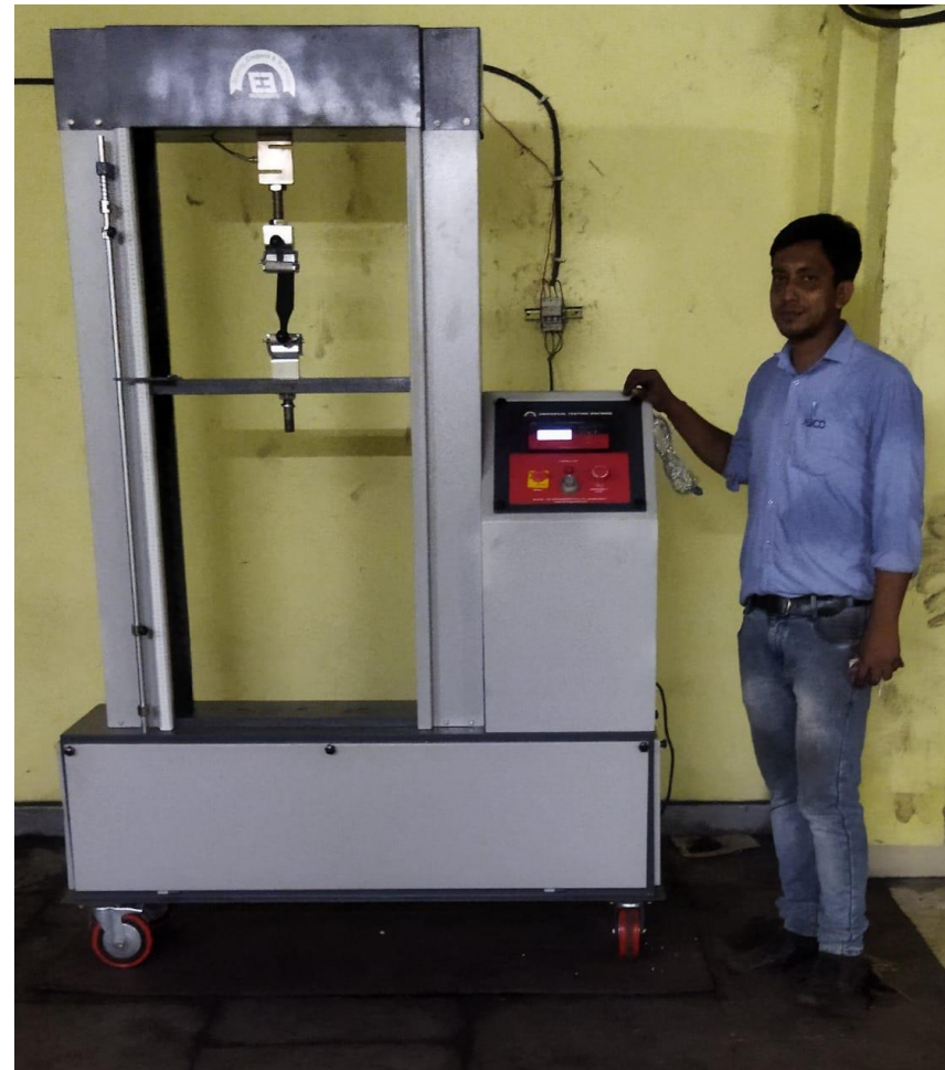
RASHMI METALIKS LIMITED, KHARAGPUR, WEST BENGAL We Supplied & Provide Demonstration