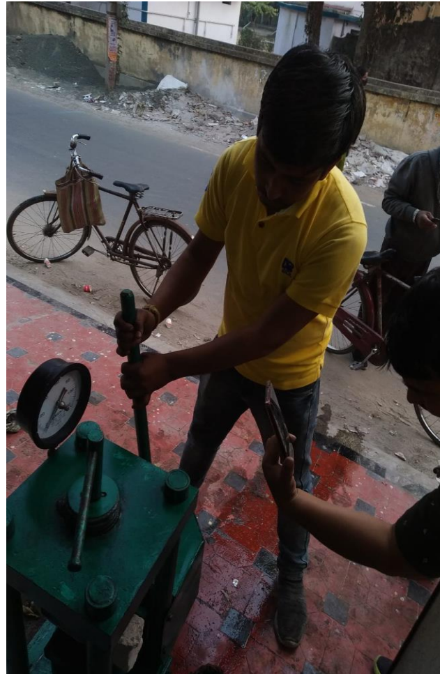
ROAD PROJECT, BARASAT, KOLKATA