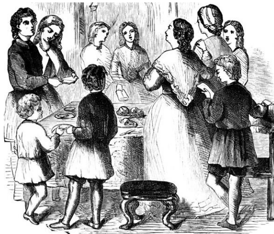
Joy at the noise of the pilgrim's coming