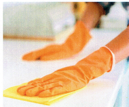
*CLEANING WITHOUT TRANSFERRING INFECTIOUS DOSE OF PATHOGENS