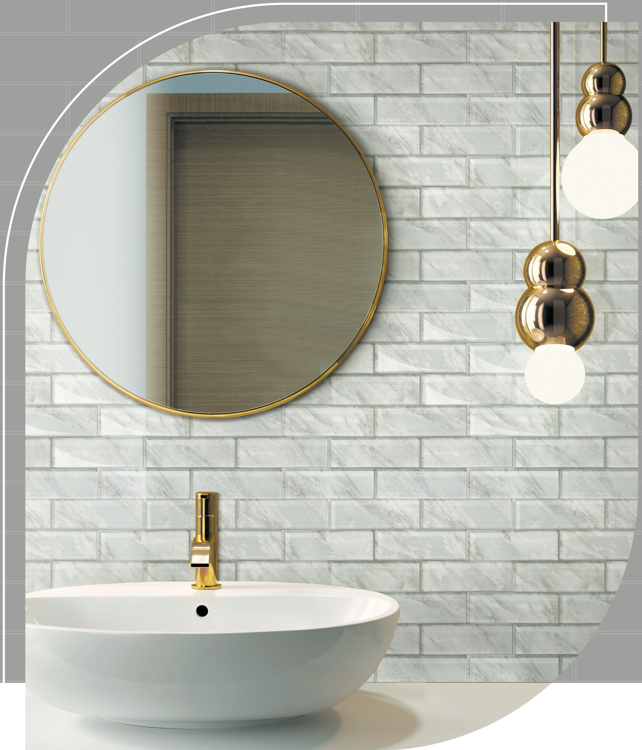
Glass Mosaic Series