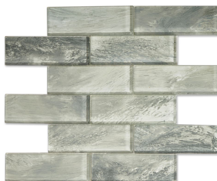
IMP04 Dark Horizon Gloss