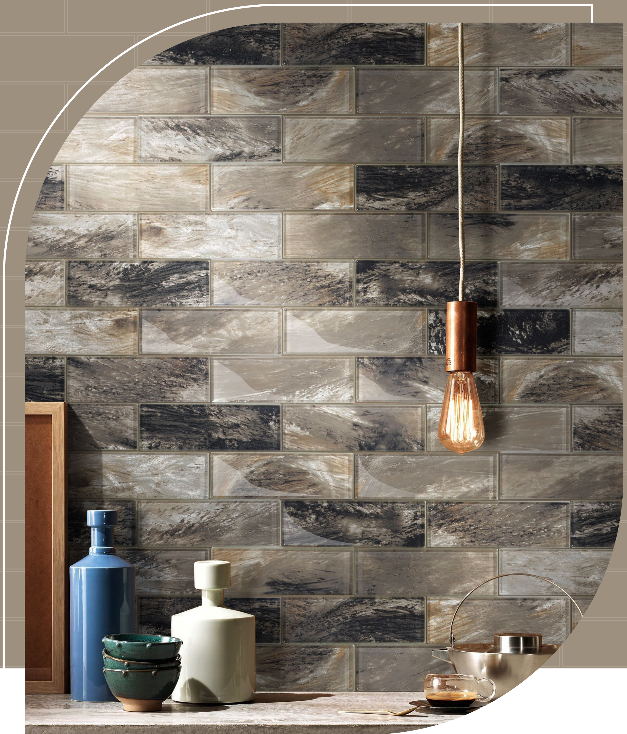
Glass Mosaic Series