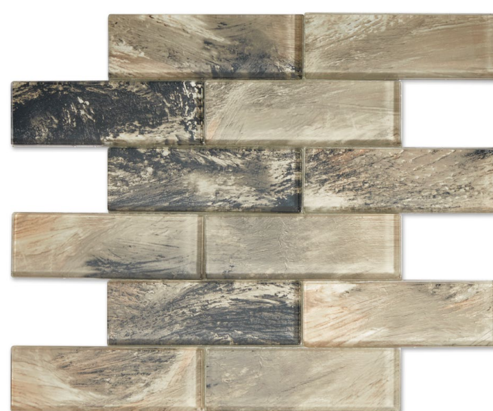
IMP02 Countryside Gloss