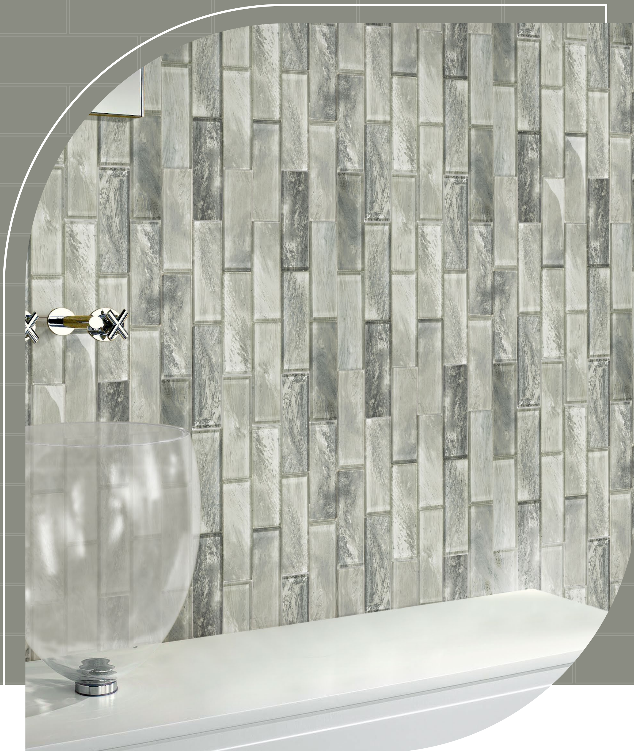
Glass Mosaic Series