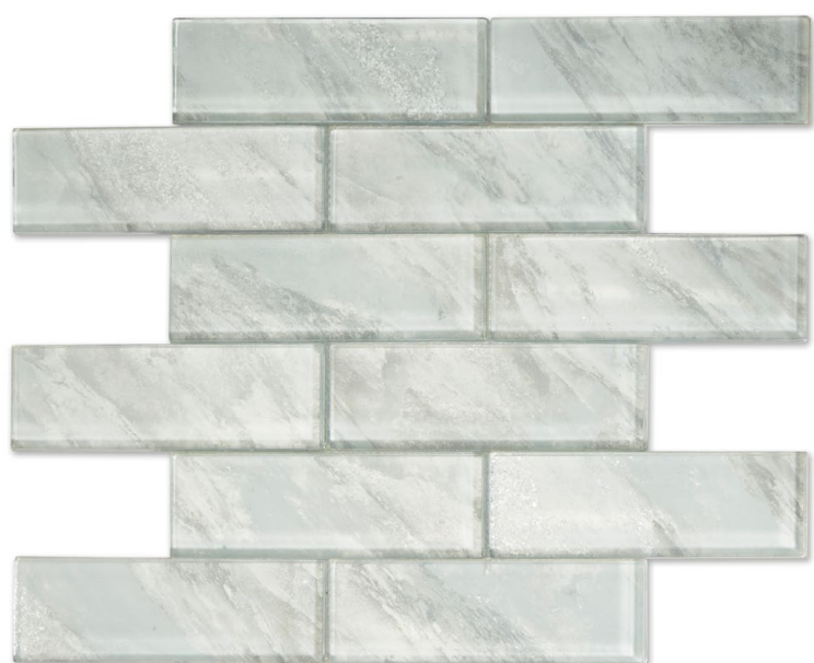
IMP01 Glacier Gloss