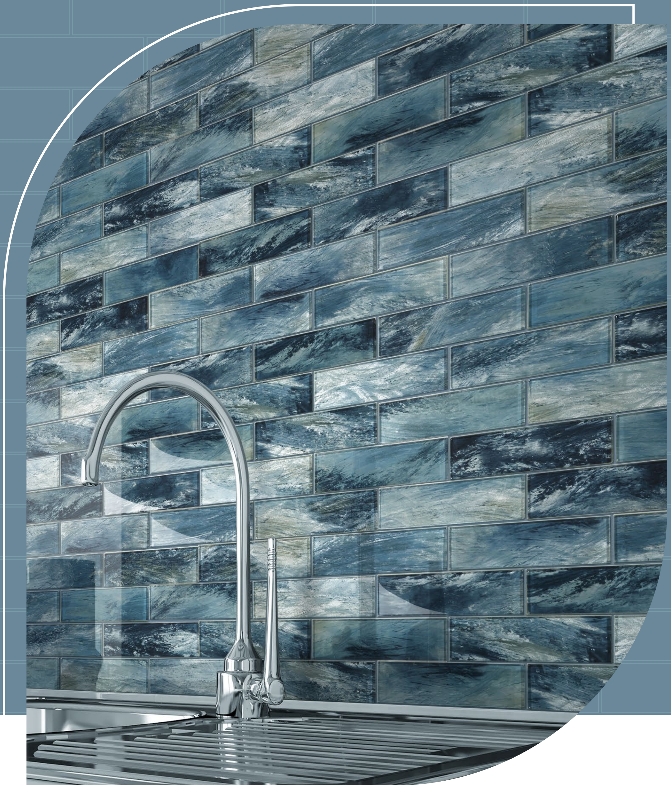
Glass Mosaic Series