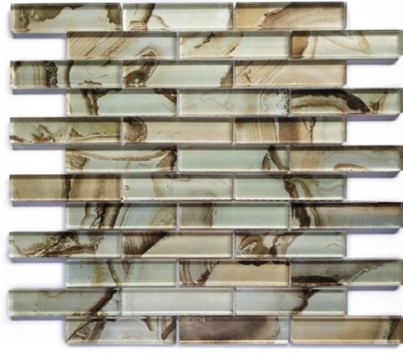
TG02 Spartel Gloss