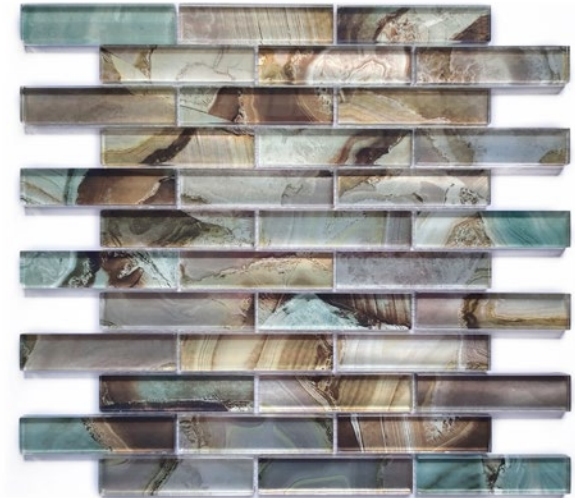
TG05 Mirage Gloss