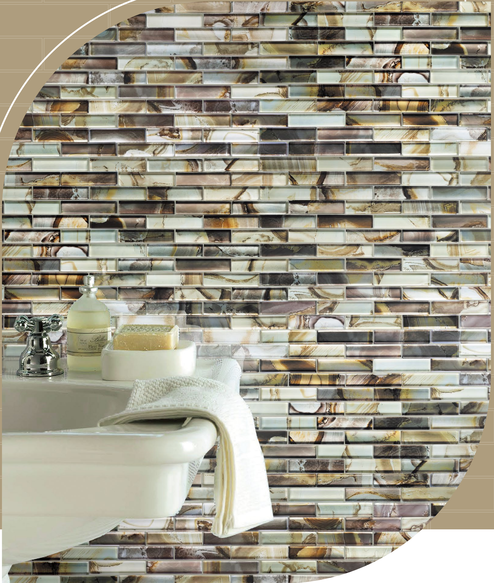
Glass Mosaic Series