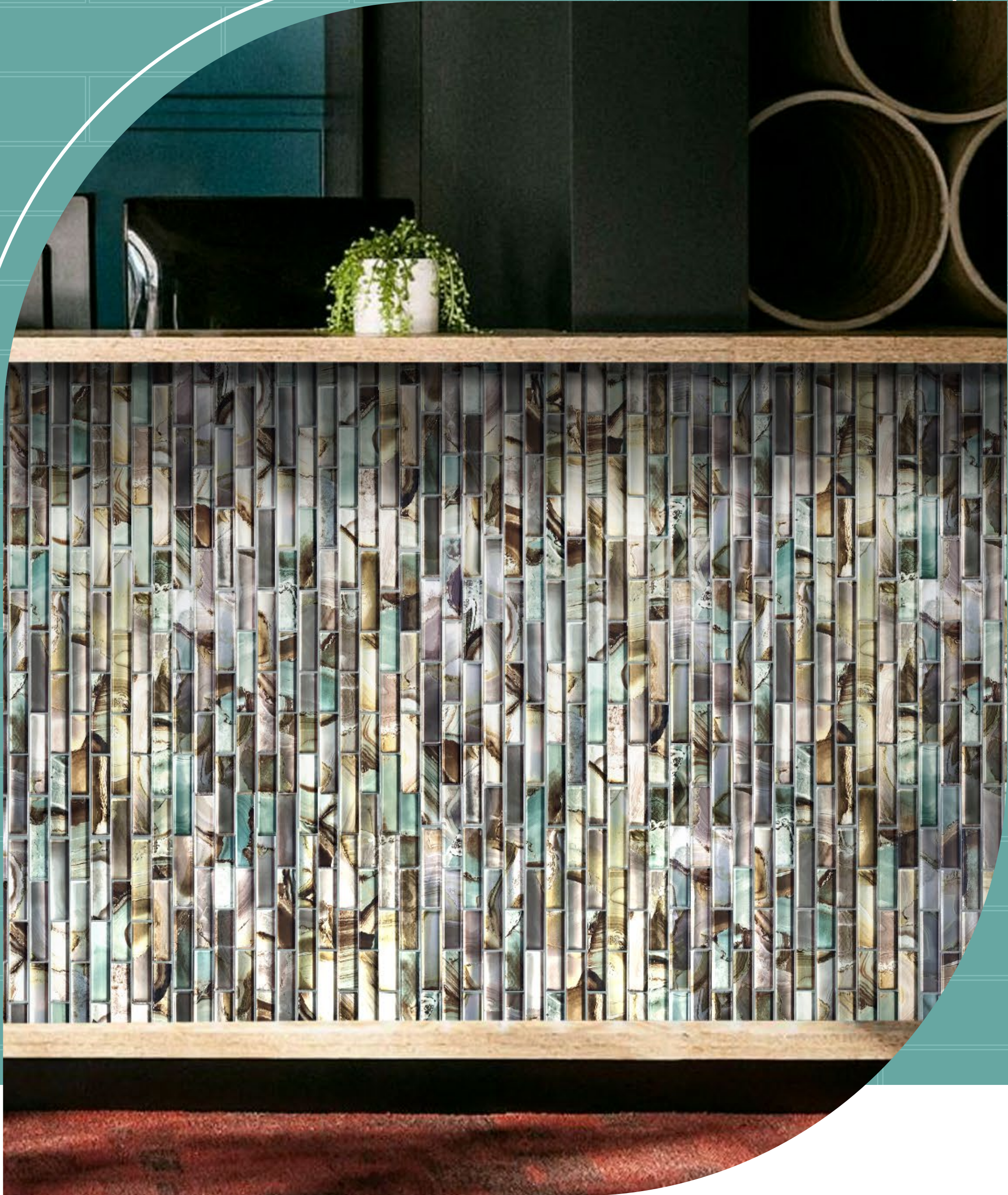
Glass Mosaic Series