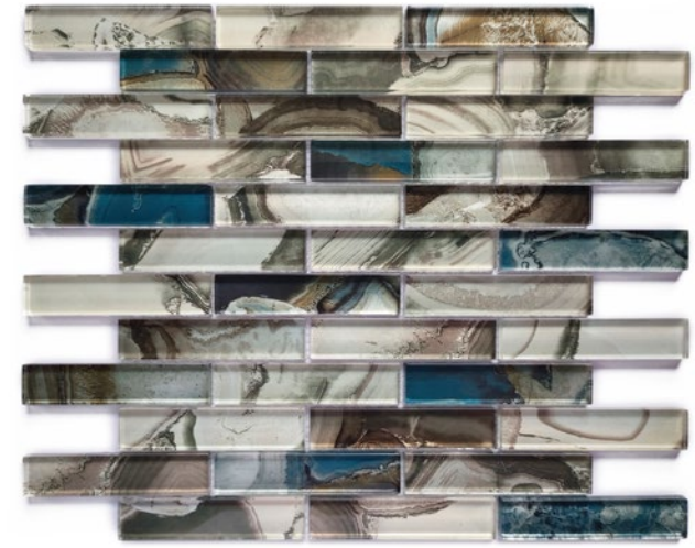
TG06 Morocco Gloss