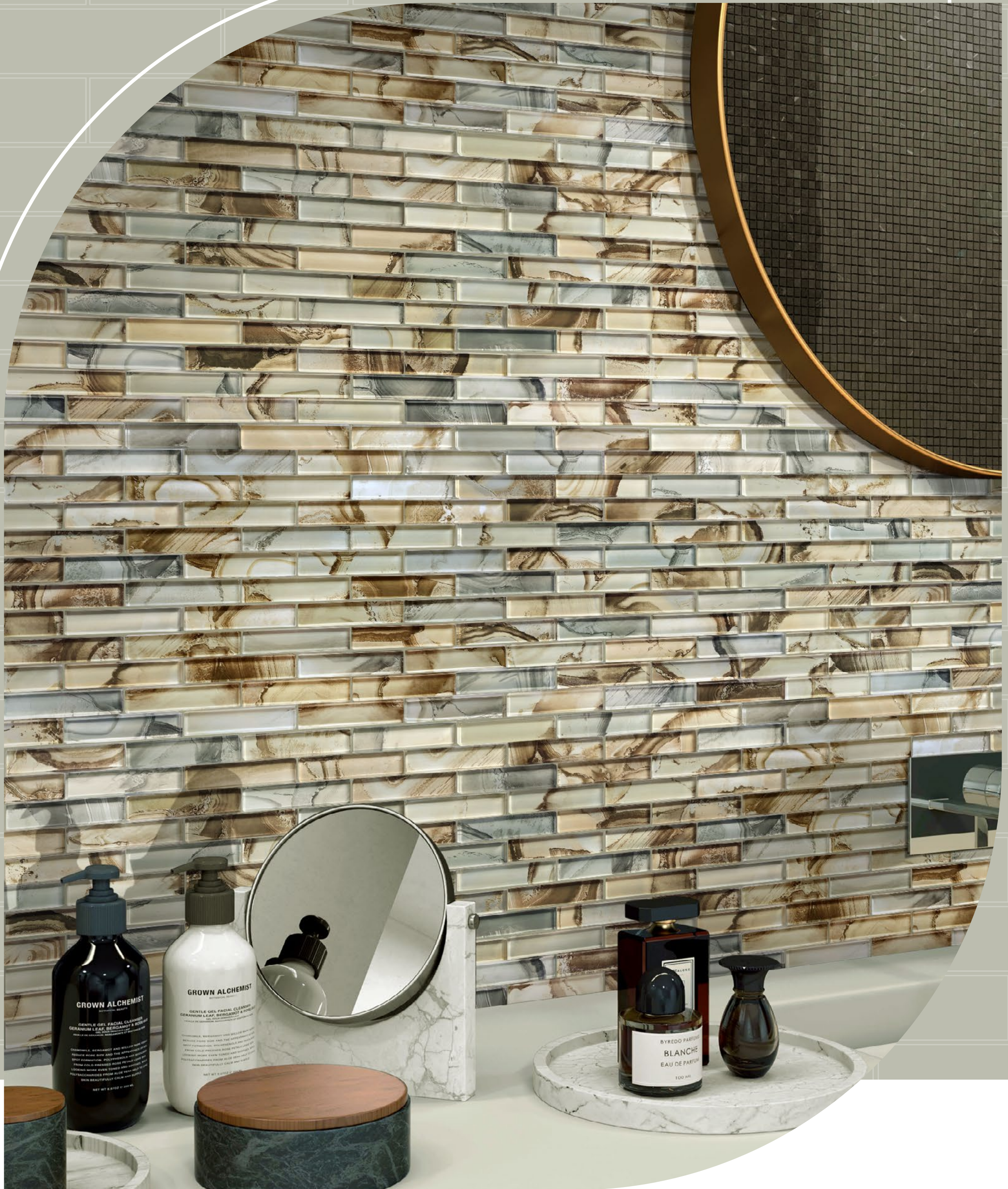
Glass Mosaic Series