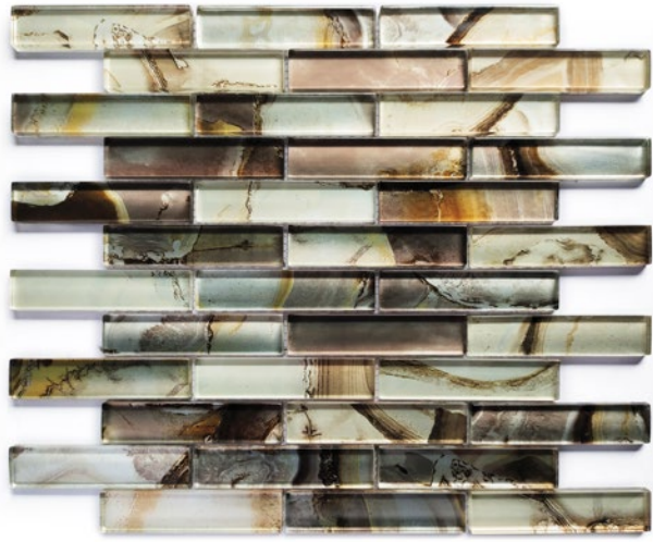
TG04 Medina Gloss