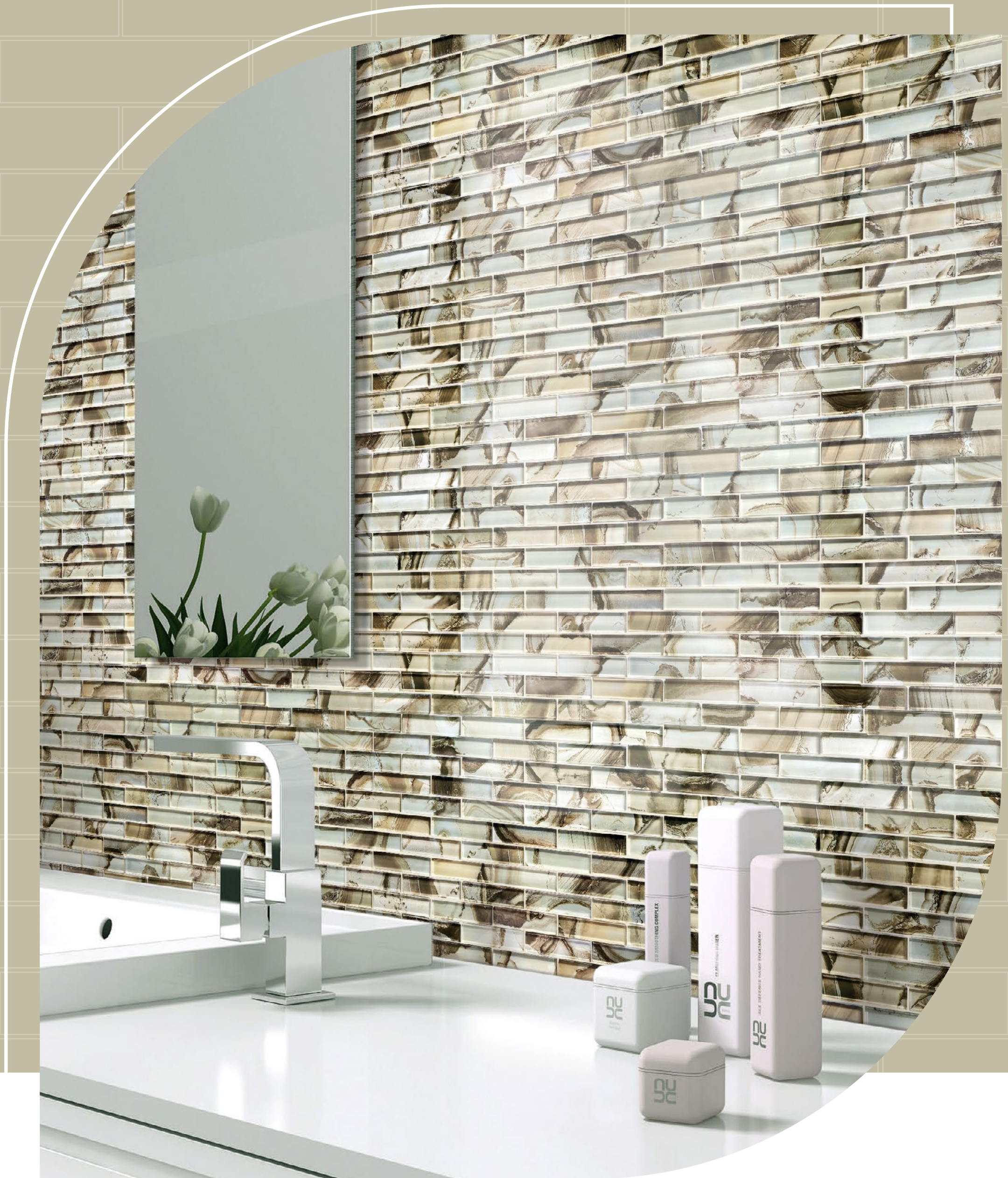
Glass Mosaic Series