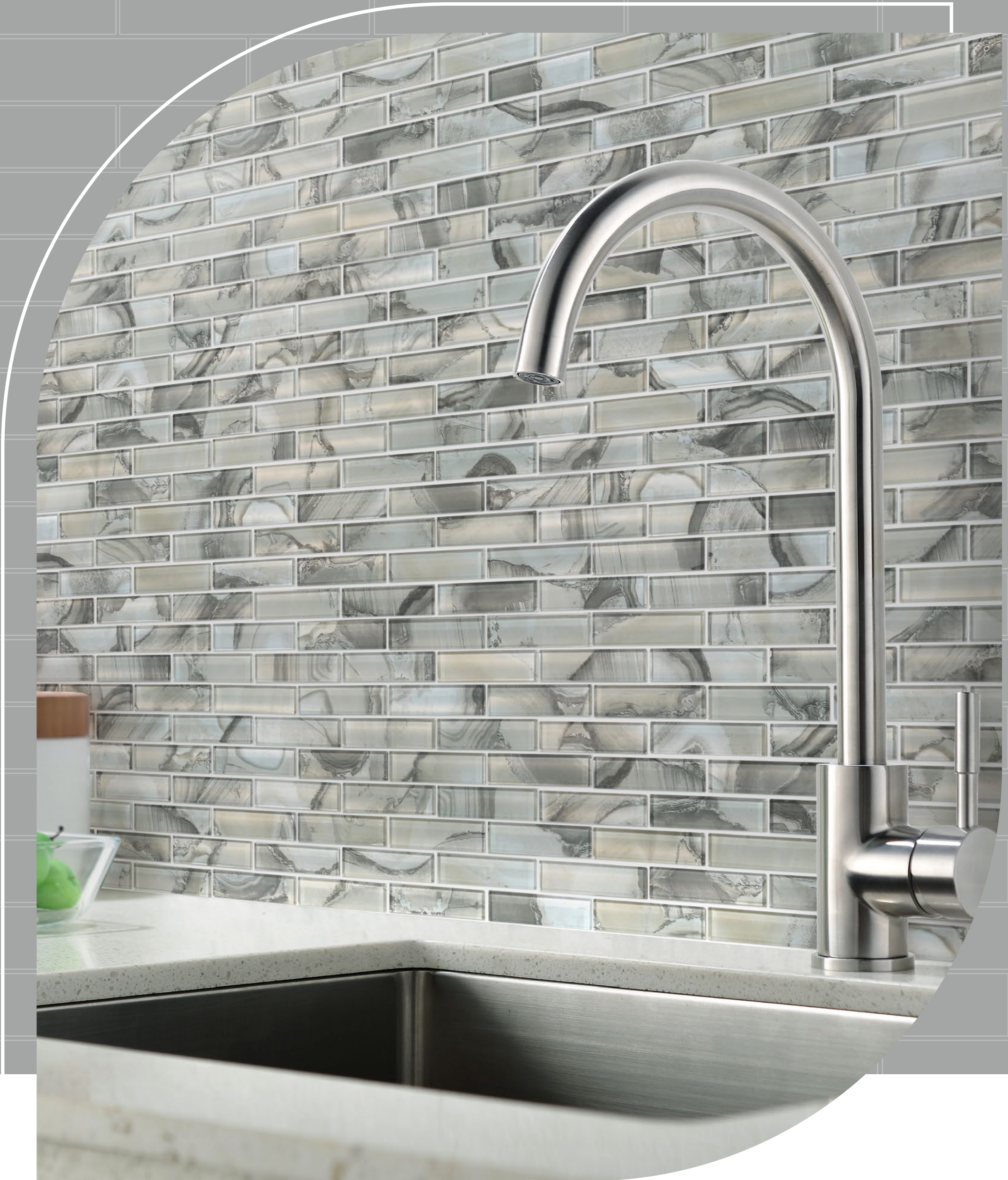
Glass Mosaic Series