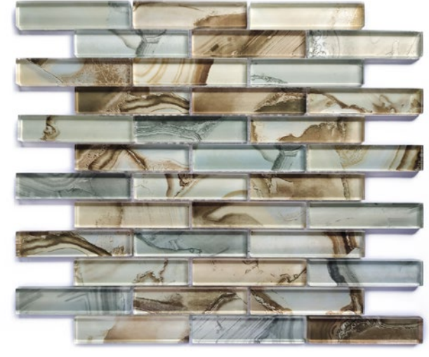
TG03 Casablanca Gloss