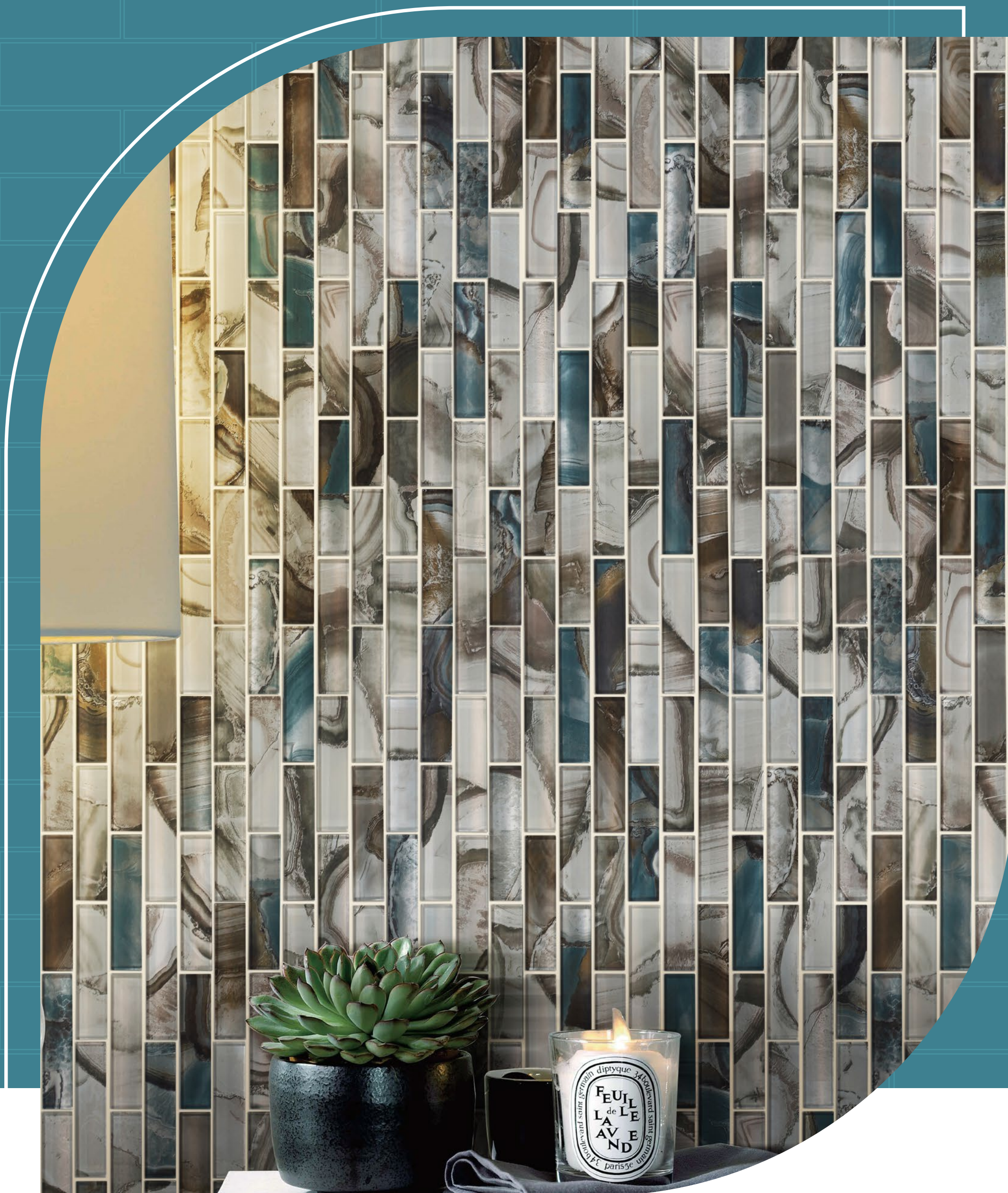
Glass Mosaic Series