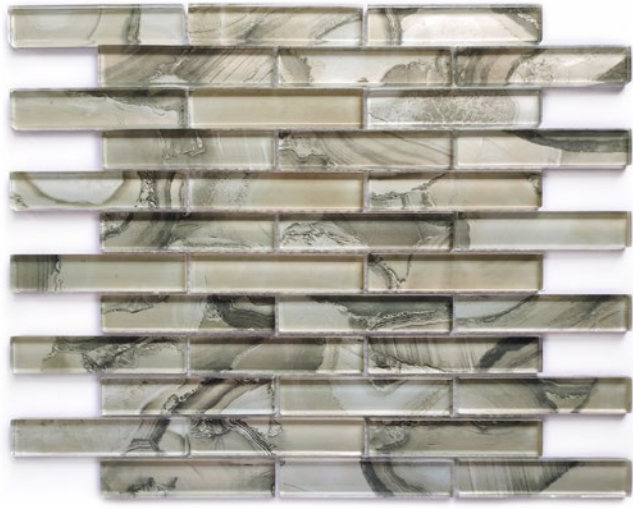
TG01 Rif Gloss