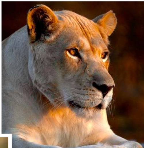
X2 White Timbavati lions X7 African Tawny lions