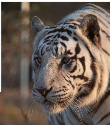
X2 Siberian tigers