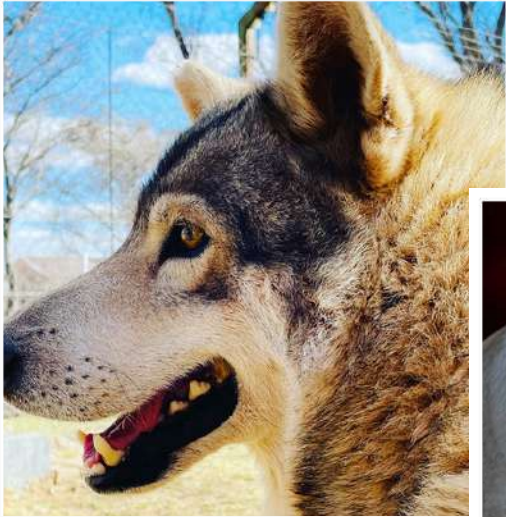
X2 Canadian timber wolf's