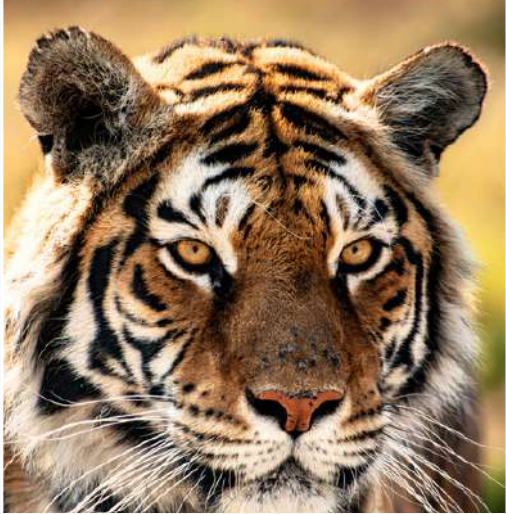
X 8 Bengal Tigers