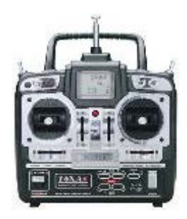
6-Channel Computer Transmitter

Radios can be designed for sailplanes, powered planes, helicopters, or a combination of any of the above three. This is particularly true with computer radios. Some radios will only contain software for one craft type, while others may contain software for all three. While it is technically possible to program an aircraft radio for helicopter use and vice versa, it is much easier if the proper software is available in the radio. So, if you think you may wish to try your hand at a heli someday, consider getting a radio that supports both planes and helis.