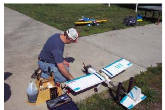
Getting Ready to Fly!

box typically includes a place for a starting battery, tools and basic gear. You may also wish to consider getting a fishing tackle box. A tackle box will often have many small sealed compartments that are perfect for storing small spare parts, such as screws, wheel collars, extra glow plugs, etc. I've listed some of the tools and supplies you will probably need. This is not a complete list and as you progress, you may find the need for additional tools and equipment. Most pilots start with basic tools and slowly build up their flight gear and replace basic items with more advanced items.