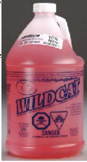
Glow Engine Fuel

Consider looking at the better and larger sport 2-stroke engines. Some engines use bushings instead of bearings. Better engines typically use bearings. Why look at bigger and better engines? Your second plane of course! Purchasing a good engine for your trainer means you can use your trainer engine in your second plane! For the 40 sized trainer example I listed here, my suggestion is to use a bearing 0.46 2-stroke, such as an OS-46FX. If you are under budget constraints, I'd suggest a slightly smaller bushed engine, such as the OS-40LA. Kits and ARFs leave the engine selection to you. A RTF will include an engine.