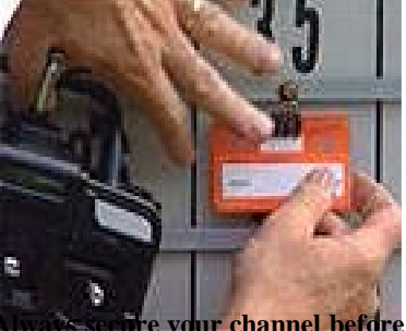
turning on your transmitter.

4. Range check your radio. Always follow the suggested range check procedure for your radio. You should occasionally perform two tests, one with the engine off and one with the engine on. If you notice a large separation in range between the two tests, i.e., more than 20%, STOP! You have a problem.