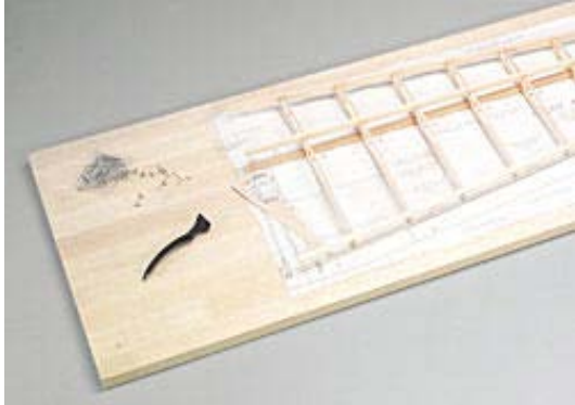
Building from a kit.

If you have the time, I strongly suggest you build from a kit. Building will give you an in-depth knowledge of the interworkings of your plane. If you want to get into the air quickly, I'd suggest an ARF. I'd avoid most RTFs unless you are under serious time/budget constraints. I'd also be careful about bundled systems that include the plane, engine and radio. While a bundled system may offer a good savings, be sure you understand which radio and engine is included before you purchase.