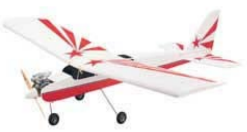
Typical Glow Trainer - GP 40 ARF Shown

You need a trainer. Trainers are inherently designed for the sole purpose of teaching the fundamentals of flying. Trainers offer stability often not found in other planes. Basically everyone learned how to fly with a trainer. If you are unsure of which planes qualify as a trainer, ask an experienced pilot.