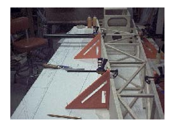
Straight and True Models Fly Better