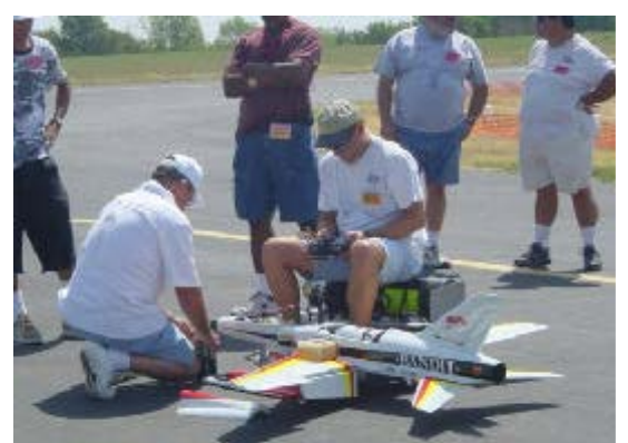
Bandit Turbine Undergoing Pre-Flight Checks.

An experienced pilot that properly performs pre-flight checks will have a ritual they perform before each flight. Watch an experienced pilot and notice how they check their plane before every flight. To start, you may wish to write down your pre-flight checklist. Eventually, you will automatically perform the pre-flight checks without the need for the list.