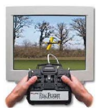
A popular Flight Simulator

pointers in the Basic Building, Setup and Flight section of this guide. I would however like to stress that the included tips in no way substitute for an instructor. In addition to field instruction, consider getting a flight simulator. There are several computer programs for the PC that simulate RC flight. These range in features as well as price, but most start around $200. I realize this sounds like a lot, but consider the following. One of the keys to learning to fly RC planes is stick time. A simulator is an excellent practice tool that can be used night or day, regardless of weather. As you become more experienced, the simulator will also be a good tool for learning harder more complex maneuvers. If the simulator prevents just one crash, your money ahead.