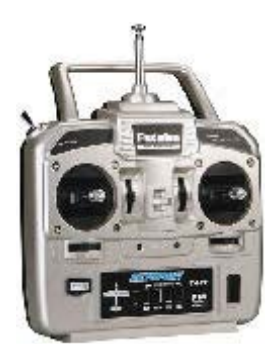
4-Channel Non-Computer Transmitter