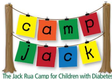
The Jack Rua Camp for Children with Diabetes