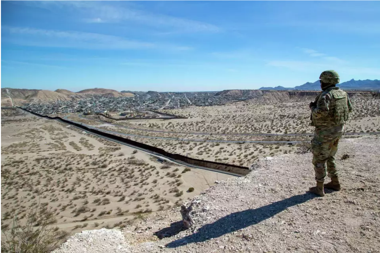
An Army soldier surveys the wall at the U.S.-Mexico border in Sunland Park, N.M. President Trump’s claims of an emergency at the border could be used to invoke the Insurrection Act and impose martial law.