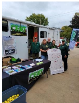
CERT Outreach Event

The mission of the CERT Rehab Team is to provide quality rehabilitation services along with a safe and secure resting area for all emergency response personnel throughout Outagamie County for extended emergency situations. This includes providing food and fluid replenishment, rest for worn out emergency personnel, and emotional support.