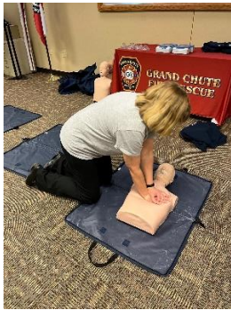
CERT CPR Training

The Community Emergency Response Team (CERT) Program educates people about disaster preparedness for hazards that may impact their area and trains them in basic disaster response skills, such as fire safety, light search and rescue, team organization, and disaster medical operations. Using the training learned in the classroom and during exercises, CERT members can assist others in their neighborhood or workplace following an event when professional responders are not immediately available to help. CERT members also are encouraged to support emergency response agencies by taking a more active role in emergency preparedness projects in their community.