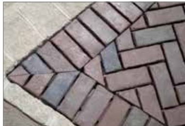
Remarkable attention to detail

REMEMBER - A quality project is built upon a solid foundation. For this reason, we recommend hiring a professional contractor.