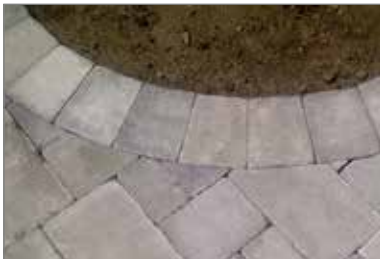
A border with excellent cuts

A great contractor will pay close attention to the details, in paver placement and cutting so that joints are even and aesthetically appealing.