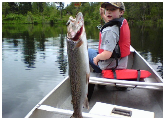
Catch and Release June 2011

If your finances are a bit pinched and coming up with your MVPCC annual dues is a challenge, there may be an alternative for you. The Board will consider on an individual basis, proposals to perform budgeted and authorized activities or provide budgeted and authorized goods needed for the community in exchange for monetary payment of dues. So, rather than becoming delinquent with your dues, first contact a Board member and inquire about an "In Lieu of Dues" request form and the authorized budget items that are applicable to ILOD. Proposals need to be turned in to the board in January – February 2012.