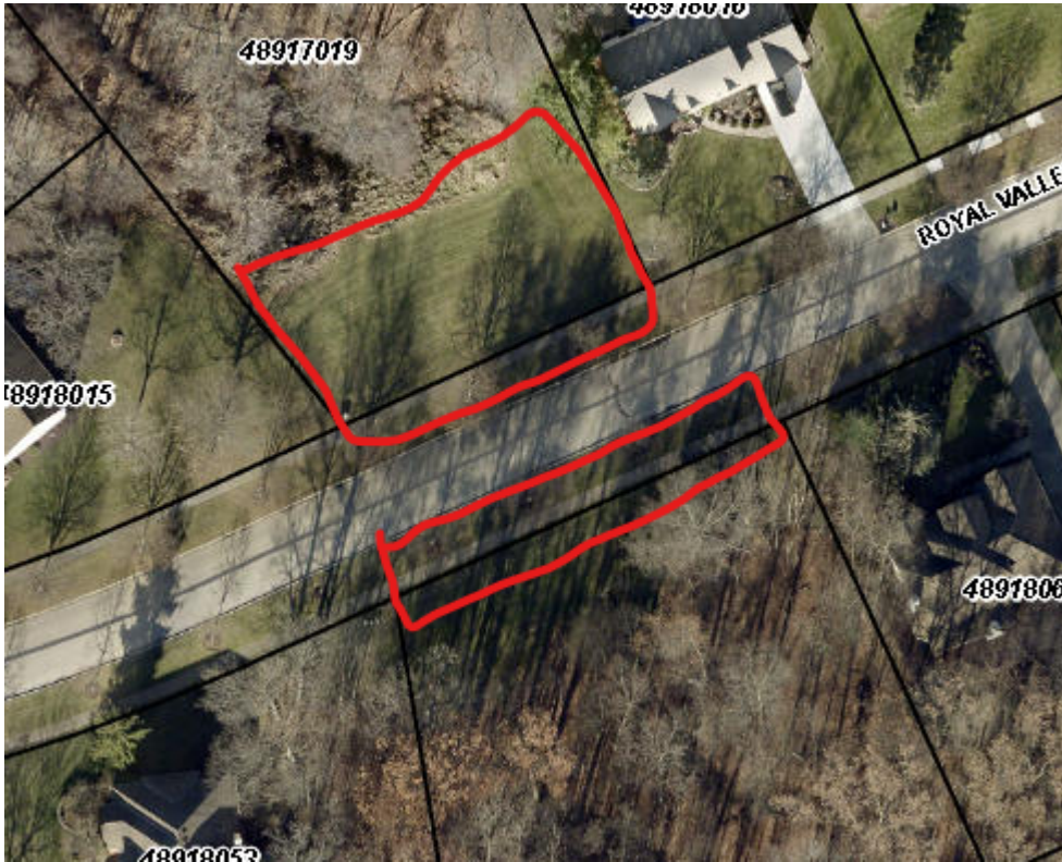
Common area to the right of 9601 Royal Valley and across the street to the left of 9620 Royal Valley