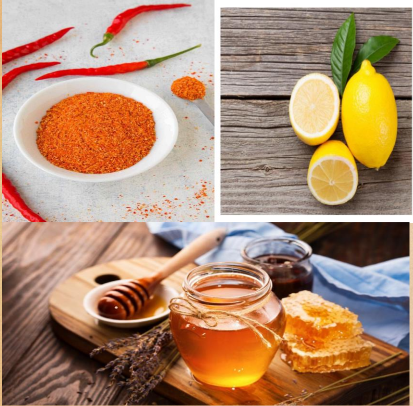
Cayenne Pepper, Honey, and Lemon