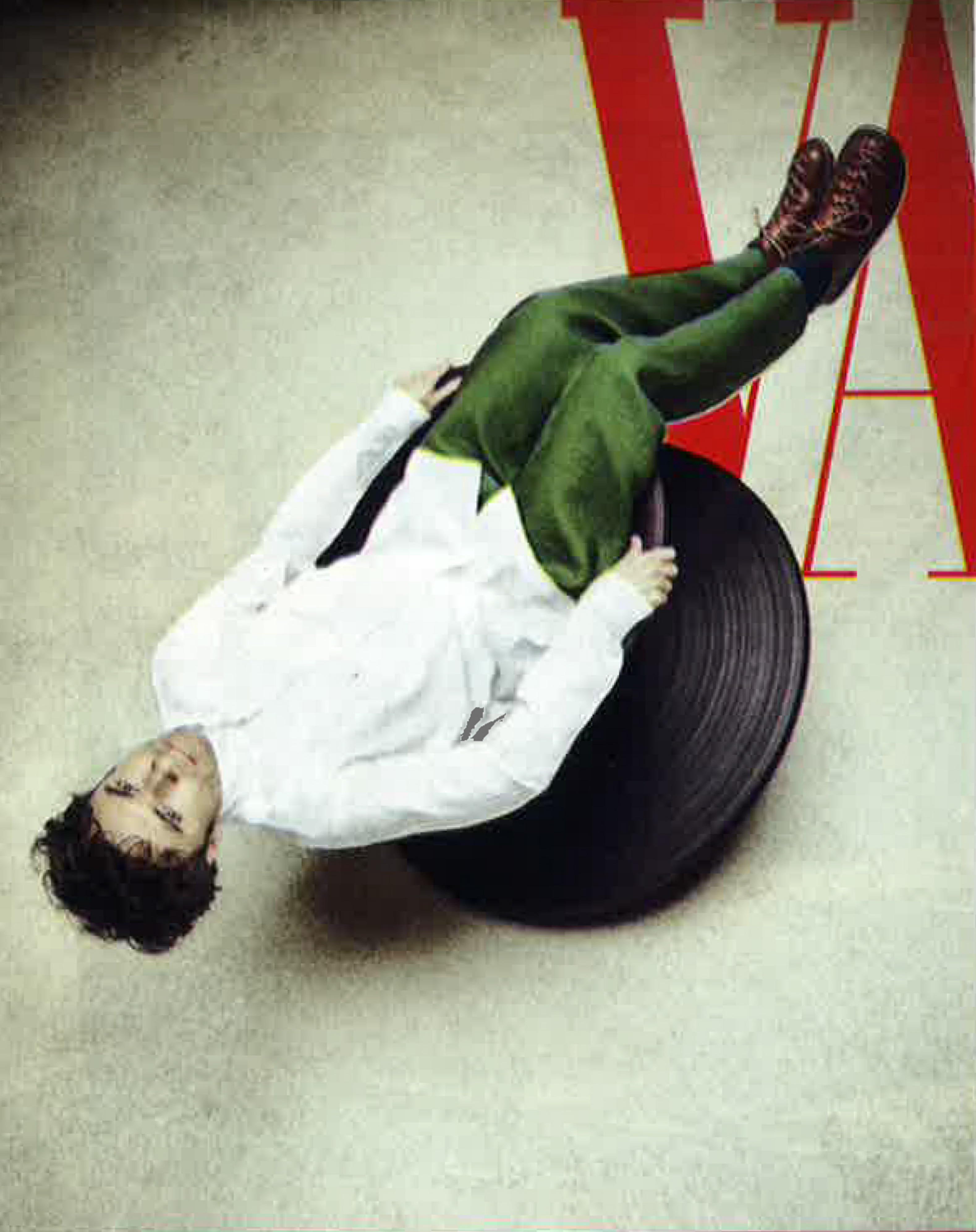
Clockwise from above: Thomas Heatherwick (page 152); Zadie Smith (page 184); Adele (page 122).