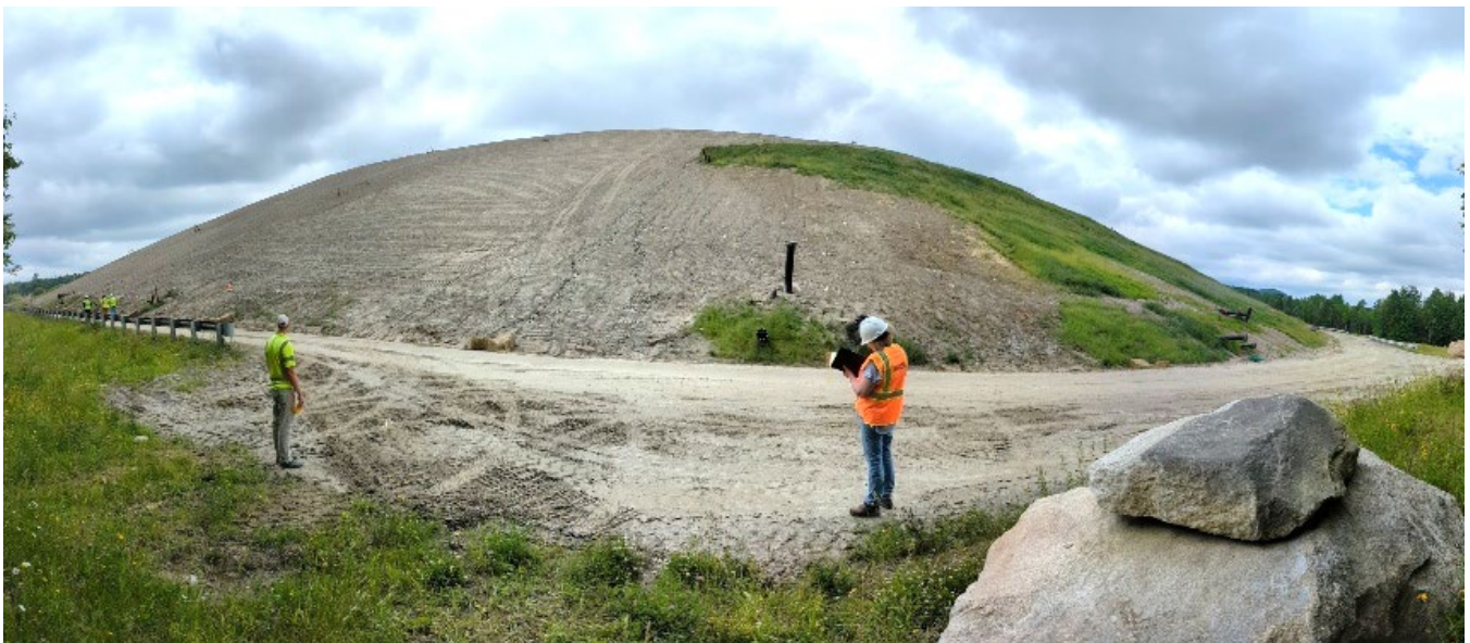
PXL_20240612_150844222PANO: Cap 4 area with intermediate cover