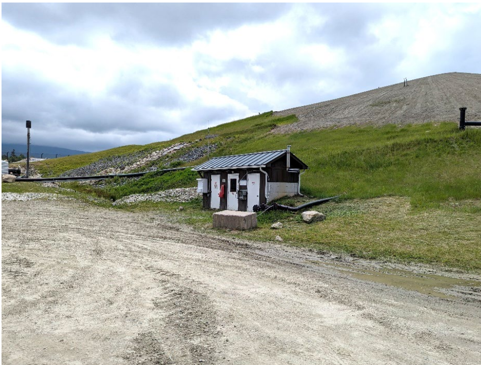
PXL_20240612_152406410: Pump Station No. 2