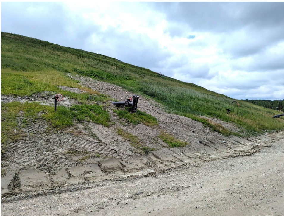
PXL_20240612_150657128: Stage V Slope erosion/repair