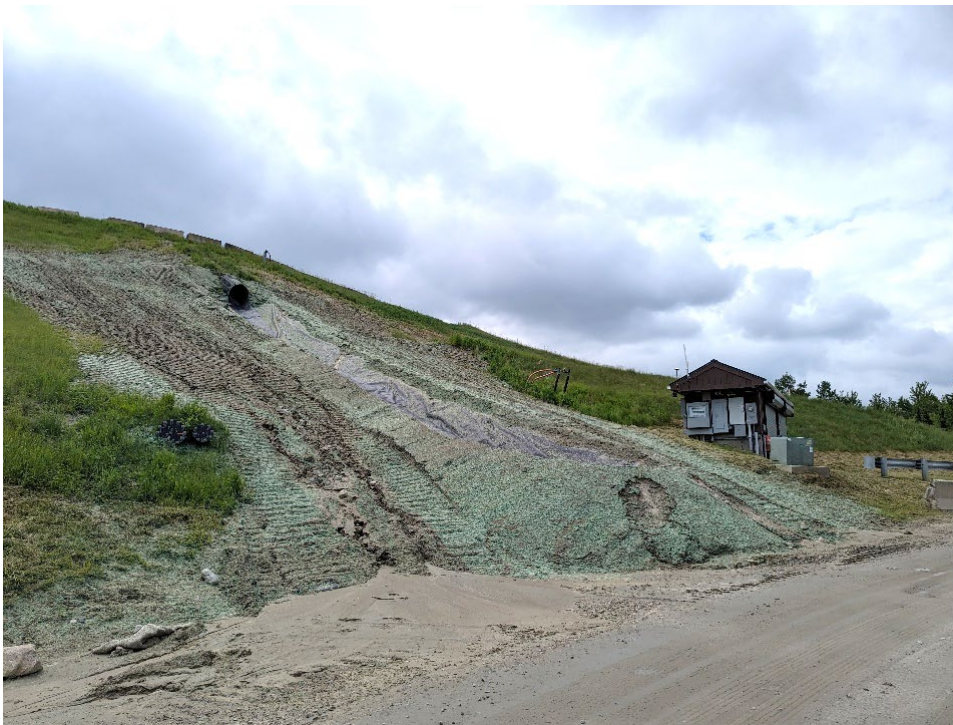
PXL_20240612_150344151: Stormwater downchute in Stage V, near Pump Station No. 1