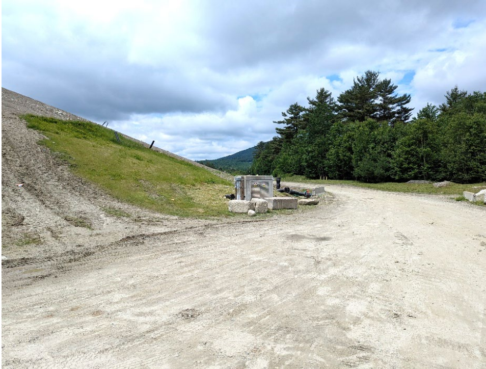
PXL_20240612_152401532: Pump Station No. 4