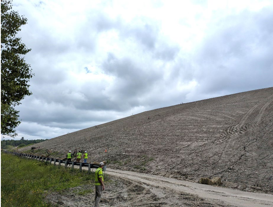
PXL_20240612_150815453: Cap 4 area with intermediate cover