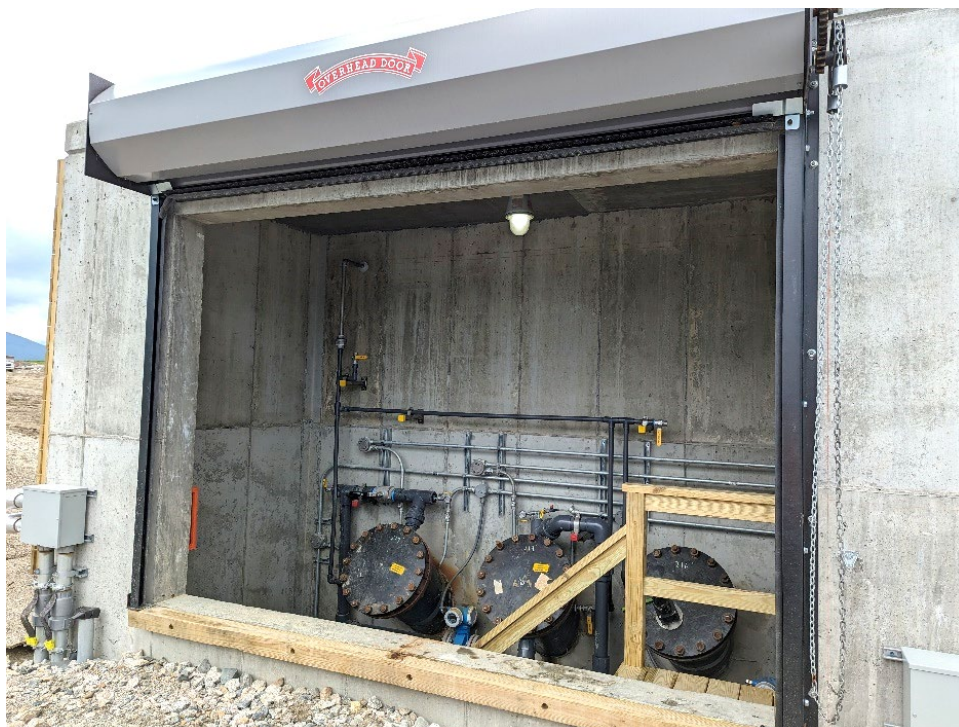
PXL_20240612_153108195: Pump Station No. 3