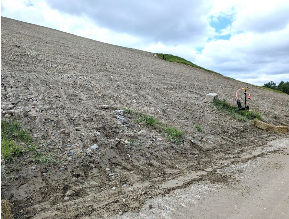
PXL_20240612_151001465: Cap 4 area with intermediate cover