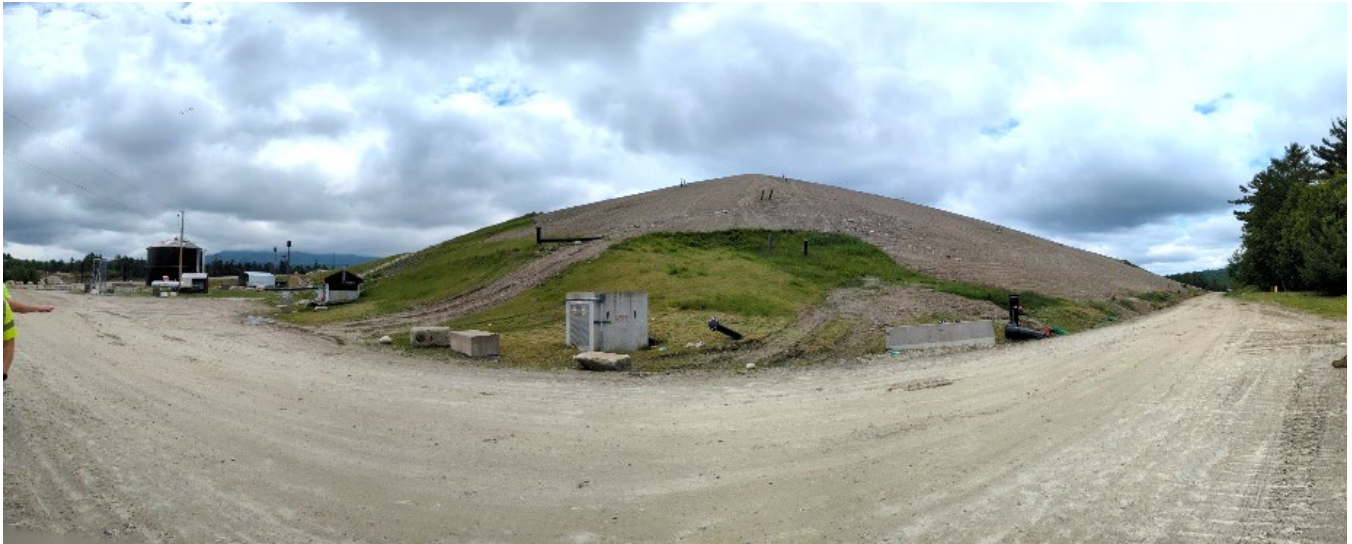
PXL_20240612_151811737PANO: Cap 4 area