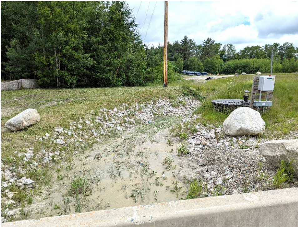
PXL_20240612_151932547: Stormwater swale near Cap 4 area