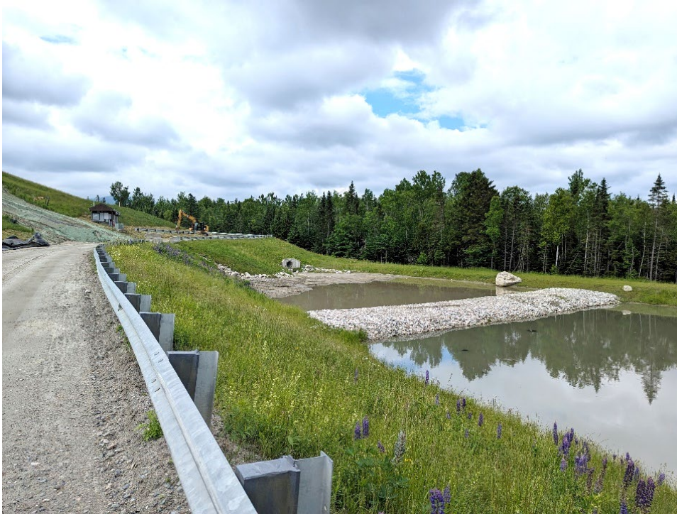
PXL_20240612_150436038: Stormwater Pond near Stage V, sediment observed in forebay