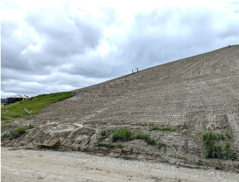
PXL_20240612_151157977: Cap 4 area with waste visible where gas header pipe was excavated and re-pitched