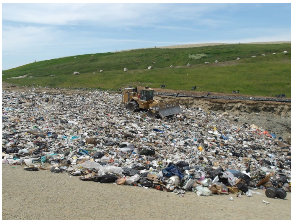
100-0024.JPG Stage VI, Phase II