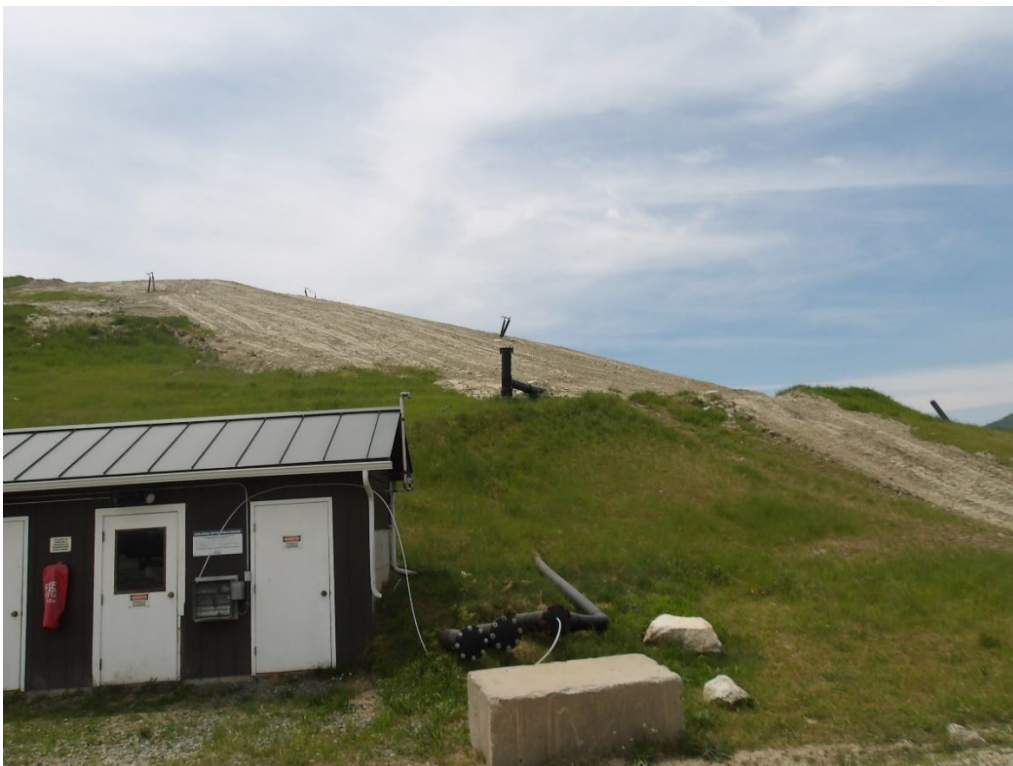
100-0024.JPG CAP 4