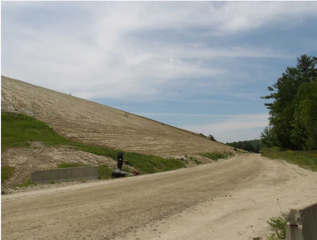
100-0024.JPG CAP 4