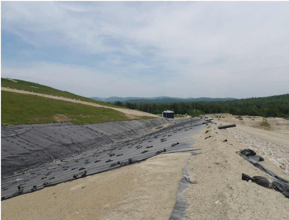
100-0024.JPG Stage VI, Phase II Scrim