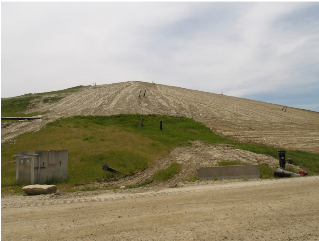
100-0024.JPG CAP 4