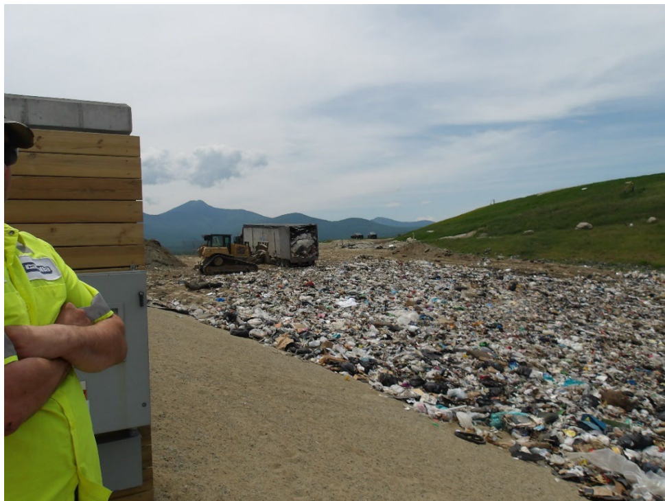
100-0024.JPG Stage VI, Phase II