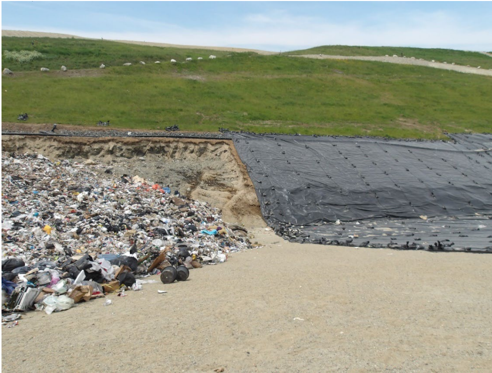
100-0024.JPG Stage VI, Phase II