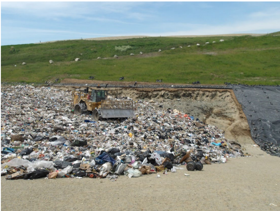
100-0024.JPG Stage VI, Phase II