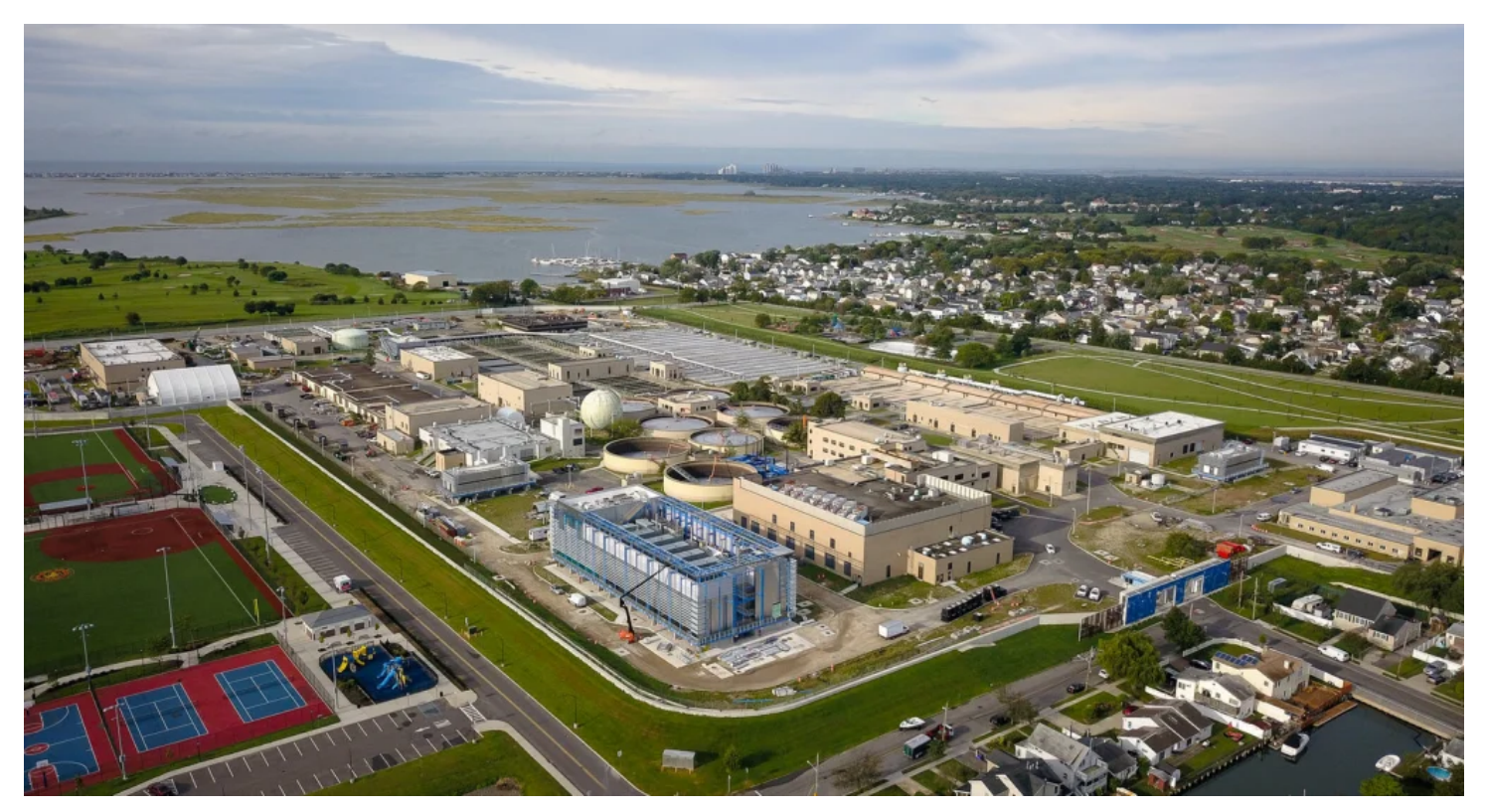
Casella Organics wants to begin accepting sewage sludge from the Bay Park plant on Long Island.

But even those relaxed limits are not enforced because the state does't require sewage sludge to be tested for any PFAS chemicals.