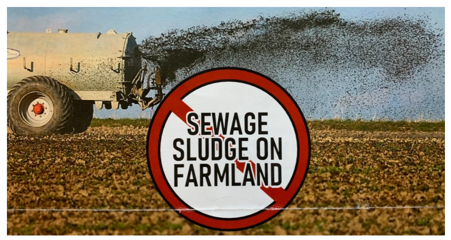
Pamphlets handed out at the Bath Town Council meeting Monday urged the public to attend a free film, "Toxic Farmland," at the Thurston Town Hall Friday.

A third Steuben County town voted Monday for a one-year moratorium on waste project expansions after at least a dozen impassioned voices at a town meeting made clear their vehement opposition to new imports of sewage sludge to be spread on local farmland.