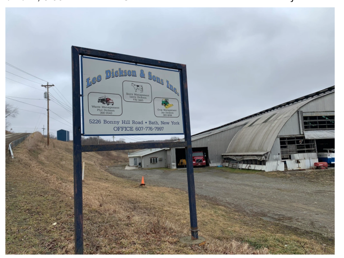
The Dickson family has spread sewage sludge on its farm fields for decades.

Casella acquired the Dickson sludge operation in July 2022 for $2 million, according to the lawsuit. That transaction involved the purchase of 150 acres on which the main facility is located and leases on another 2,700 acres of fields.