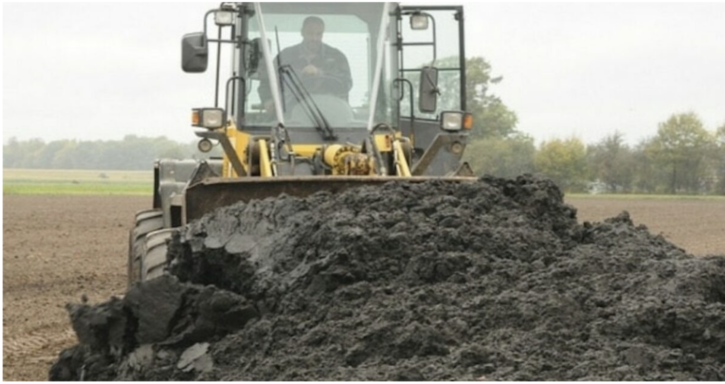
THURSTON, Feb. 16, 2024 — A unit of Casella Waste Systems Inc. filed suit late yesterday against the Town of Thurston to try to block enforcement of a new local law that bans the spread of municipal sewage sludge on certain Steuben County fields.