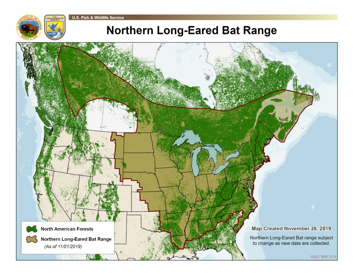
Figure 1. Species Distribution Map for the Northern Long-eared Bat https://www.fws.gov/midwest/endangered/mammals/nleb/nlebRangeMap.html

Northern long-eared bat roost trees are almost always found within 2.0 km of open water (Cryan et al., 2001) and many are found in forested wetlands (Foster and Kurta, 1999). There is also good evidence that northern long-eared bats preferentially roost in higher elevation sites, particularly upland hardwood forests (Lacki and Cox, 2009; Timpone et al., 2010). All of these conditions exist, and some even dominate, at the GSL Project Site. It is also well documented that maternity roosts, where females and the young spend the summer months, are primarily found in tree crevices, not under loose bark (Lacki and Schwierjohann, 2001; Perry and Thill, 2007). Therefore, the characterization of areas as "smooth bark forest" does not preclude potential suitable habitat, particularly when the tree species identified by the Habitat Assessment are known to be used by the northern long-eared bat.