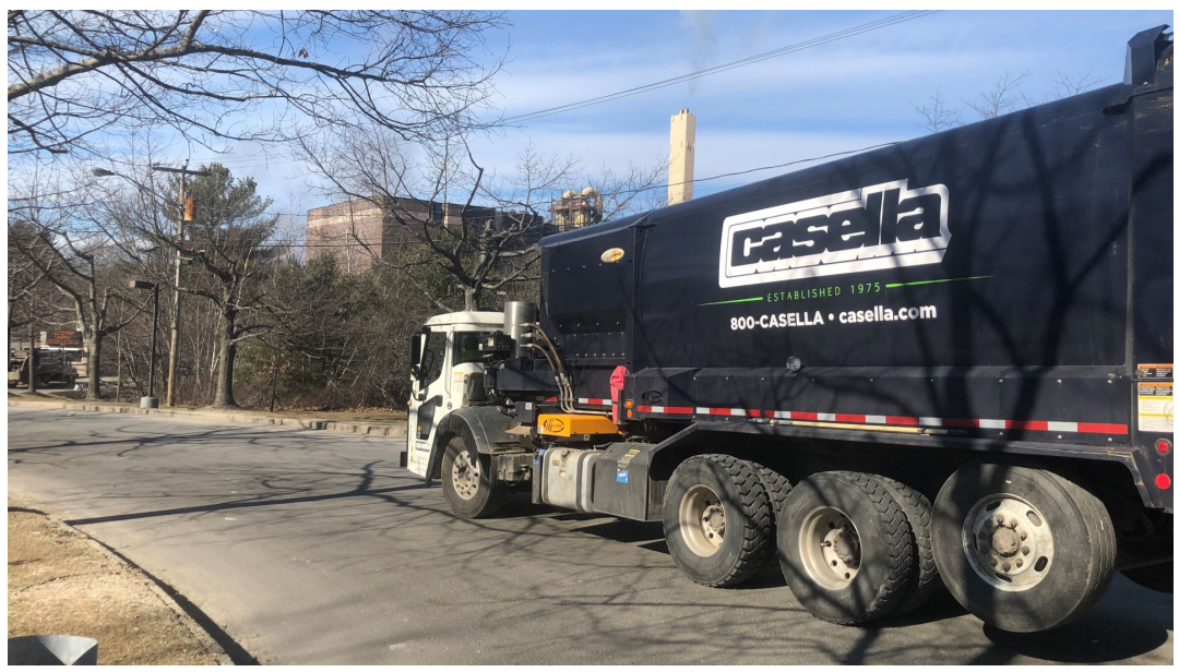
A Casella waste truck heads toward the ecomaine incinerator and trash plant on Blueberry Road in Portland.

Those cost increases, which communities around the state have faced in recent years, coupled with the idling of the plant in Hampden (meant to take waste and recycling from more than 100 towns) and the idling of one of the Maine's four waste-to-energy facilities last May have all contributed to more material being buried in landfills.