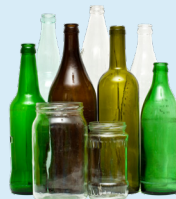
Glass Bottles & Jars (Empty food & beverage bottles & jars)