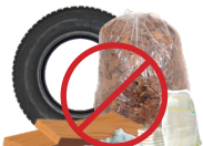
WOOD, WASTE, OR TIRES