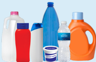
Plastic Bottles, Jugs, Tubs, & Lids (Empty kitchen, laundry, & bath containers)