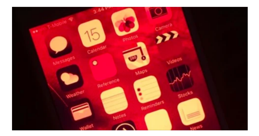
iPhone 8 and before

Do you want to turn your iPhone screen red and protect your body clocks from 100% of damaging blue and green light? Then this article if for you, brought to you by the team at BLUblox. The first section is for those with older iPhones, 8 and before and the second section helps those with newer iPhones. X and above.