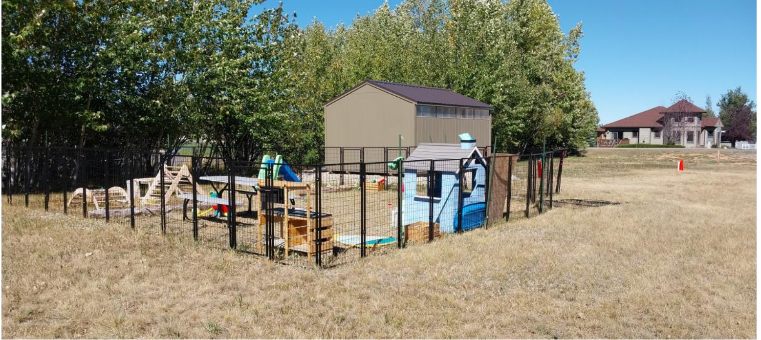
Meadowlark's playground on a sunny September day.