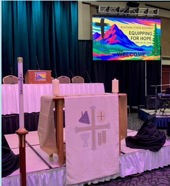
Opening of the Synod Assembly

Thank you for sending me as Messiah’s Representative.