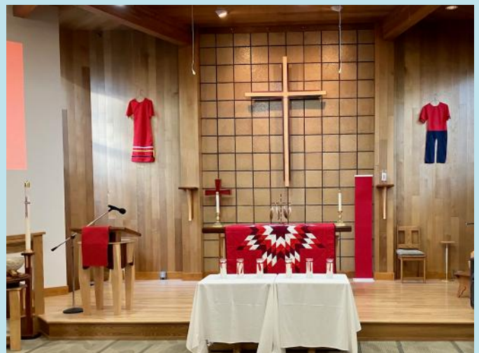
Candle light Vigil Setting