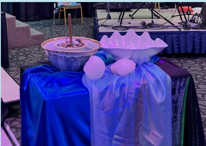
Waters of Baptism