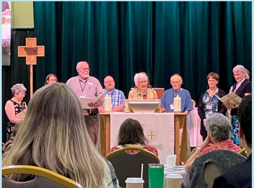
New LMAs, Lay Ministerial Associates being installed