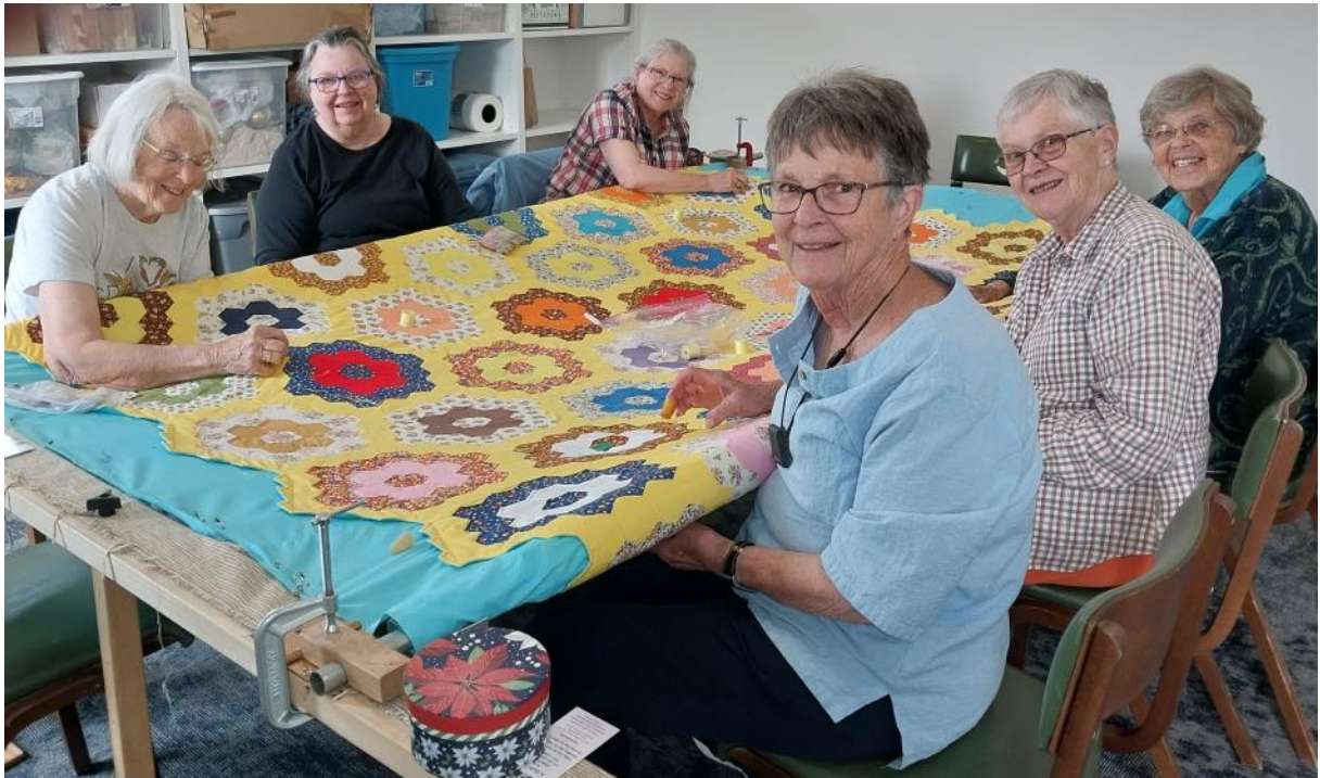
Charity Quilters working together on this lovely hand quilted creation. You just cannot get this kind of love in a store bought quilt.