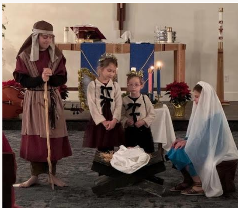
Angels and the Holy Family