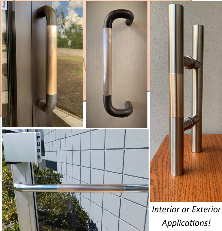
Interior or Exterior Applications!