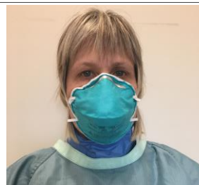
3. Don N95 mask. Ensure straps not crossed