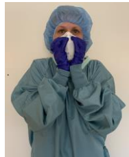
5. Perform N95 mask seal check