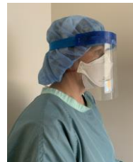
5. Don full face shield