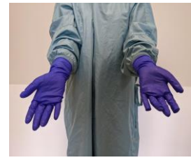
5. Don gloves