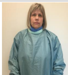
2. Don gown. Secure top and bottom ties