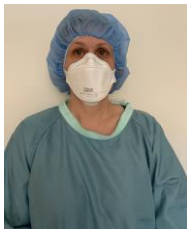
4. Don bouffant