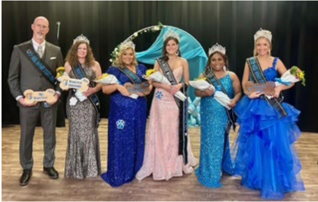
Woof Fest Royalty