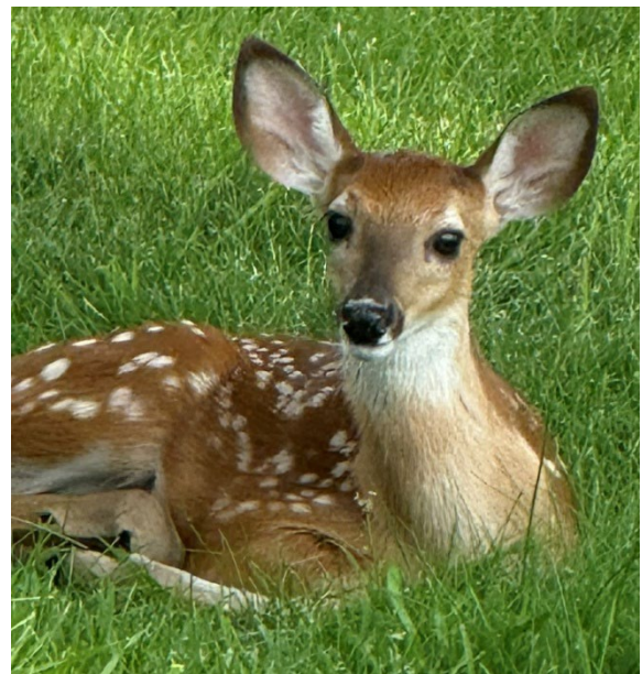
Fawn at Mountwood.