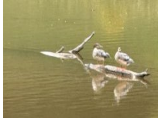
Ducks taking a break at Mountwood.