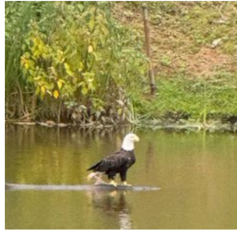
Eagle on Mountwood Lake.

Whether you are a beginner or experienced birdwatcher, you will receive a warm welcome.