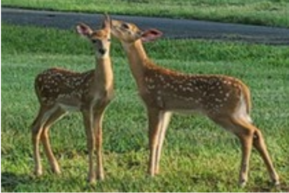
Deer at Mountwood Park.