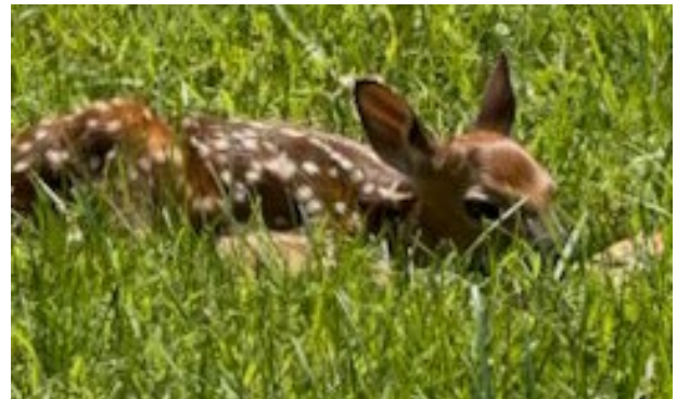
Fawn at Mountwood.

"I have not failed. I've just found 10,000 ways that won't work." Thomas Edison