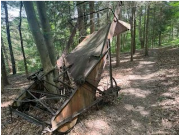
Artifact Found Near a Trail.

Every season brings change in the plant and animal life in the Park. The Park will provide you solitude in a setting of natural beauty.