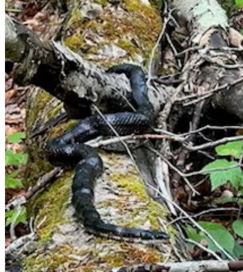
A Big, but Gentle and Beautiful, Black Rat Snake.

Biking – The River Valley Mountain Bike Association has worked tirelessly to make the Park’s almost 30-mile hike/bike singletrack network one of the eastern United States’ most regarded and most ridden single mountain bike destinations. The trails are open year round,