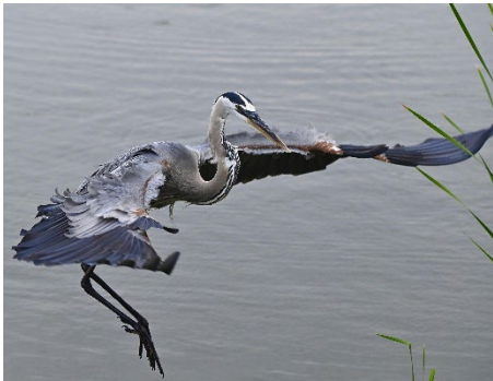
Blue Heron.

Birdwatching – A wide variety of birds inhabit the Park, with its deep forest, hillsides, cleared meadows, and wetlands.