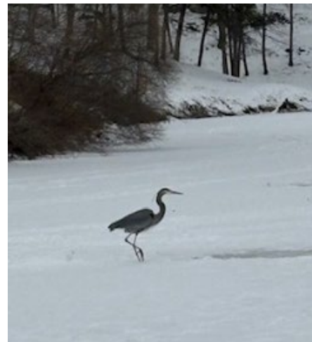
Blue Heron on the frozen Lake.

A West Virginia fishing license is required and a trout stamp will be necessary for trout fishing.