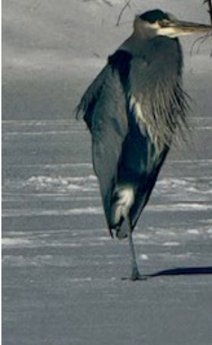
Here is another picture of our Blue Heron on the lake.

Mountwood Concession Stand – If you find yourself getting hungry, stop by the Marina Concession Stand for a tasty treat. They also have hamburgers and hot dogs cooked on a gas grill. This is also the place to rent a kayak or canoe.