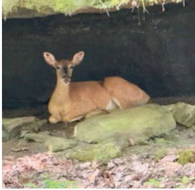
A Deer Resting on a hot day.

If you are a hiker and worried about the bikers, you are worrying for nothing. When I have been hiking, the bikers have always been friendly and sometimes even stopped to chat.