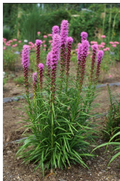
Blazing Star Liatris

Virginia Creeper Blazing Star Liatris Ninebark New England Aster Red Chokeberry Sugar Maple Coral Honeysuckle Serviceberry Eastern Redbud Black - Eyed Susans, Phlox, or Bee Balm