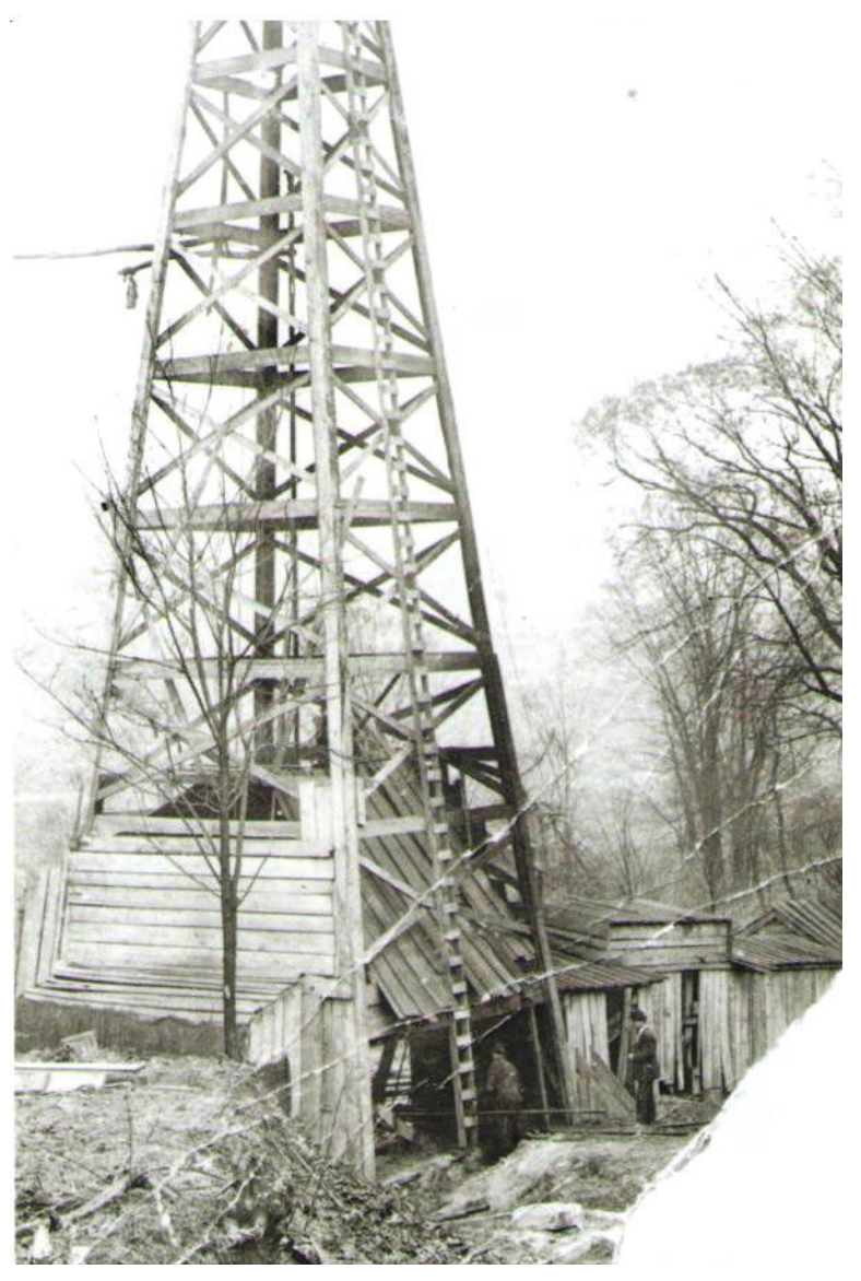
Well site.