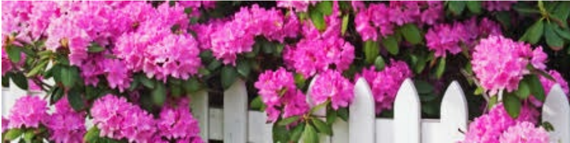
West Virginia's State Flower, the Beautiful Rhododendron