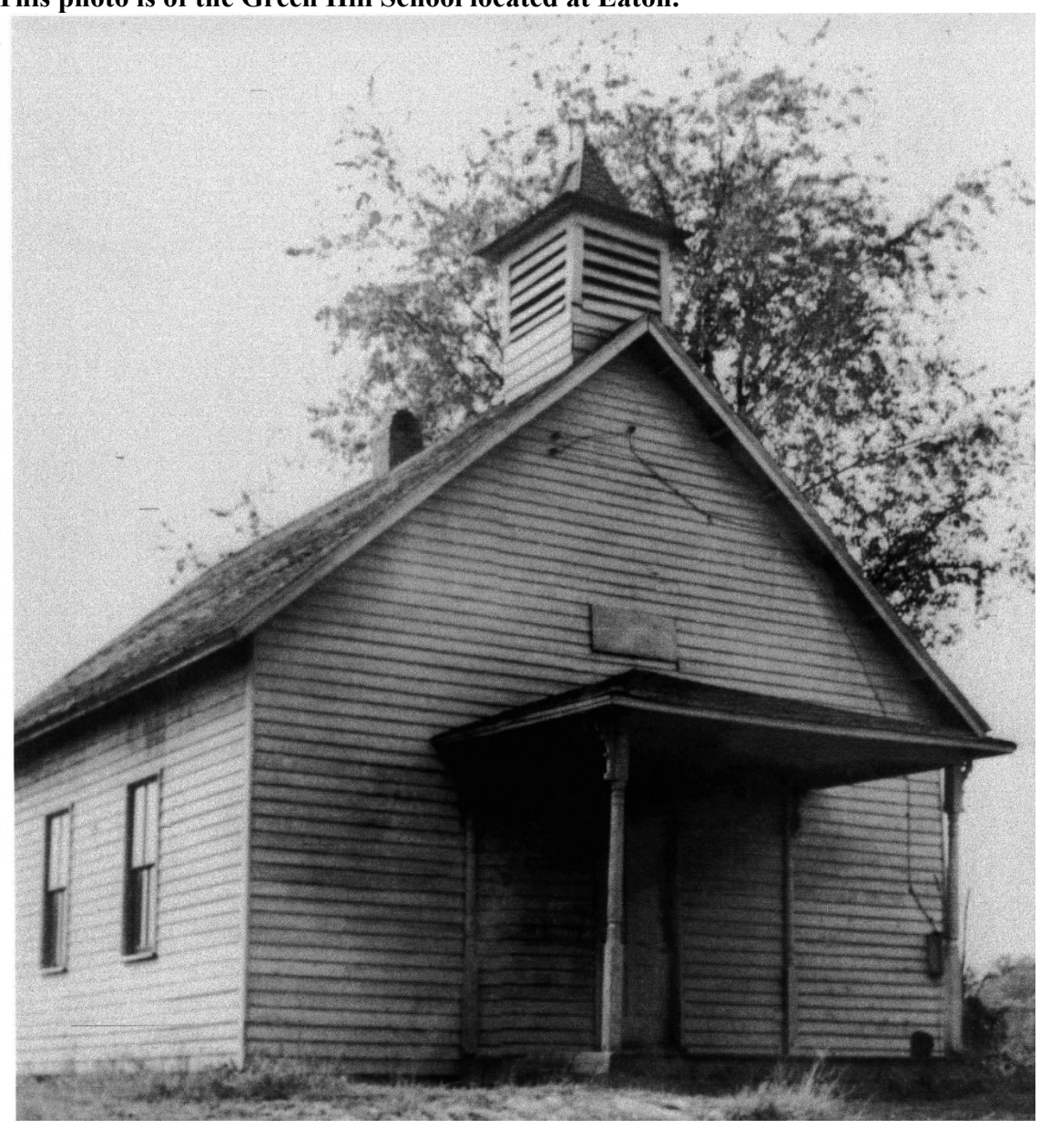
This photo is of the Green Hill School located at Eaton.