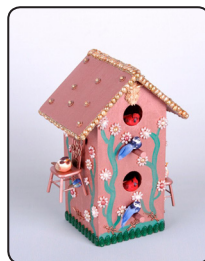
One of Corrine's many bird house creations.

The miniature furniture came along after the jewelry and during my experimentation with tapestries. I started with large tapestries and needed something to give me a change of pace before I would go on to the next tapestry. The miniatures must have been my practice for the bird houses as they can get very intricate and fit the bill for the change I needed.