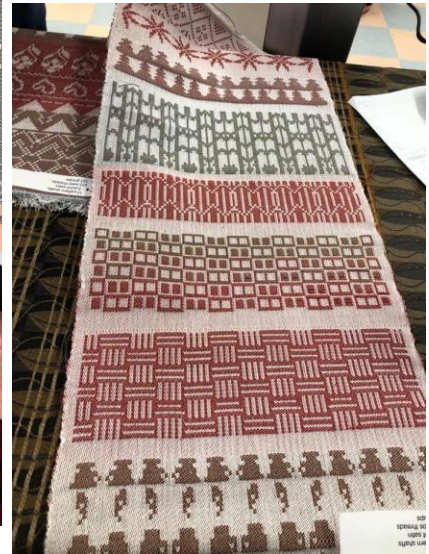
Claudia Cocco our 2018-19 Education Grant recipient - Drawloom weaving