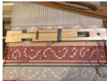
My favorite design on the single heddle. The weft is tow linen.

My next sample was on the single unit drawloom. I have to admit that I had a lot of fun playing around with the different configurations. You can “save” a pattern by using a similar approach to the half heddle method, on the pattern shafts. But those kinds of decisions are driven by which loom configuration you have, and the type of design you'd like to weave. At this point I was just playing and having fun.